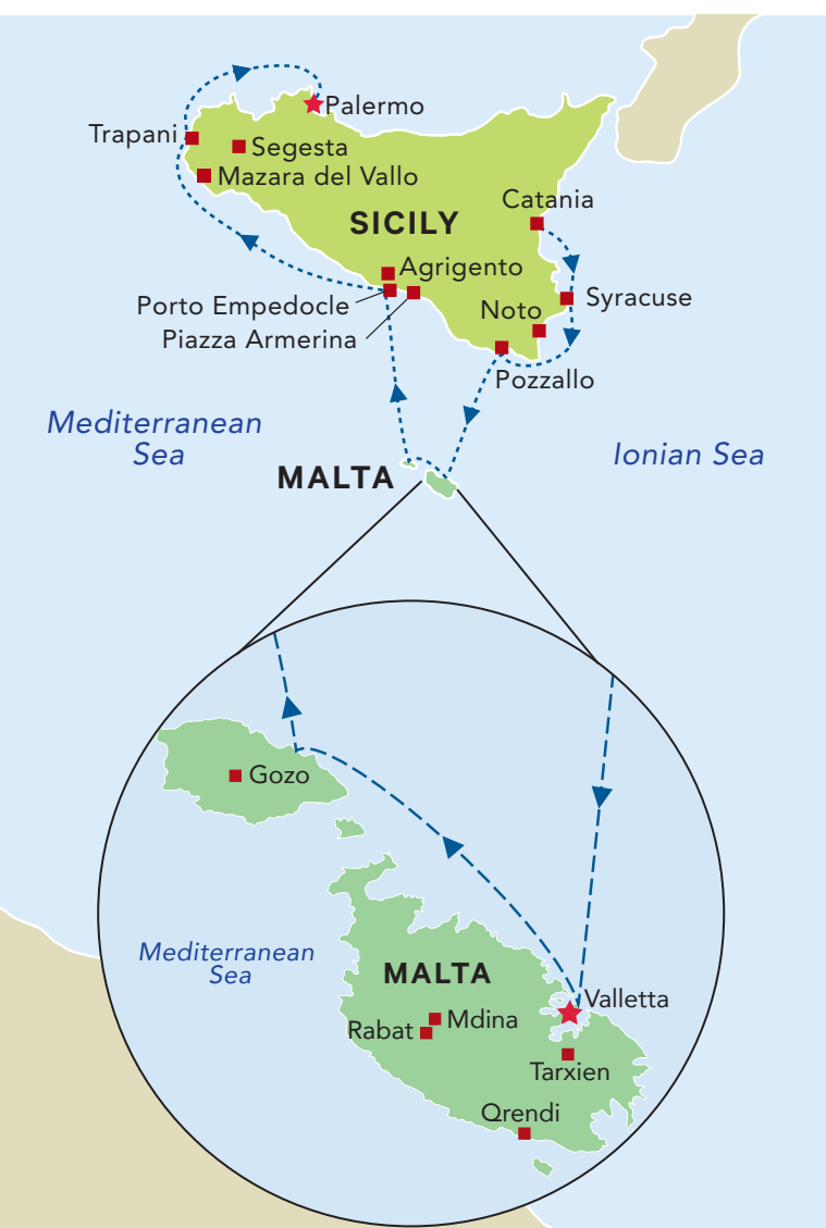
Map of the region

As you continue, marvel at the Ġgantija Temples on Gozo, standing over 20 feet tall and built 1,000 years before the Egyptian pyramids. Explore the fortified Citadel of Victoria, a stronghold since the Bronze Age, offering sweeping views of the island. Your final days take you back to Sicily, where the grandeur of Agrigento's Valley of the Temples and the dazzling mosaics of Piazza Armerina's Villa Romana del Casale reveal the splendor of ancient Greece and Rome, respectively.