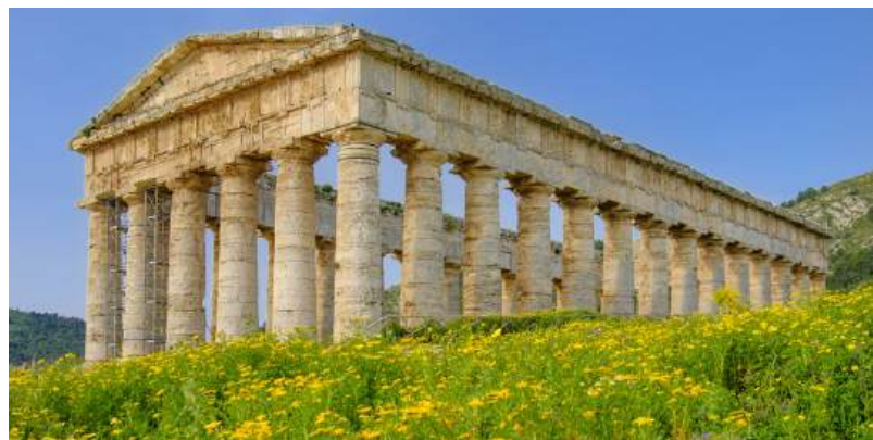
Temple of Segesta, Sicily

Extend your adventure by exploring Palermo, Sicily, on an optional postlude. Dates, details, and pricing will be shared at a later date.