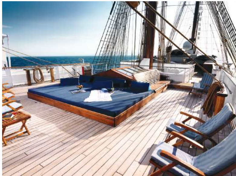
Sea Cloud II Junior Suite (top) and Lido Deck (above)