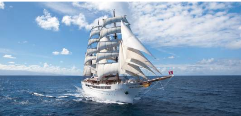
Sea Cloud II

Sea Cloud II is a three-masted sailing yacht steeped in the elegance of yesteryear and complemented with the most modern amenities. Sister ship of the legendary Sea Cloud , Sea Cloud II has 47 outside cabins and travels under 23 billowing sails trimmed by hand. From the mahogany-paneled library and gracious lounge to the gym and watersports platform, no detail has been overlooked. Praised by the world's most discerning travelers, Sea Cloud II receives consistently high rankings from Condé Nast Traveler . Passengers enjoy open seating at all meals and complimentary use of all water sports equipment. A doctor is on call 24 hours a day. Please note that there is no elevator on Sea Cloud II .