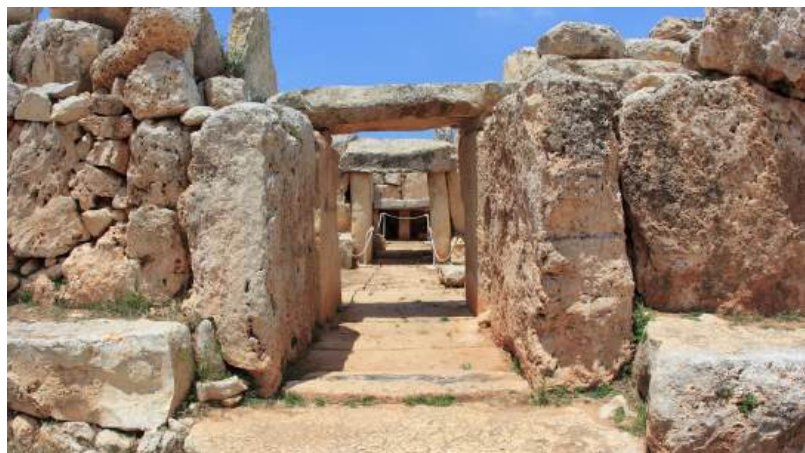
Hagar Qim Temples, Qrendi, Malta

Option 1: Head to Qrendi and the UNESCO-recognized prehistoric Hagar Qim Temples , which date back to 3,200 B.C. This hilltop temple complex overlooks the sea and the islet of Fifla. Continue to the nearby Mnajdra Temples , one of the oldest religious sites in the world, built between 3600 and 2500 B.C. These ancient megaliths feature precise solar alignments that mark the equinoxes.