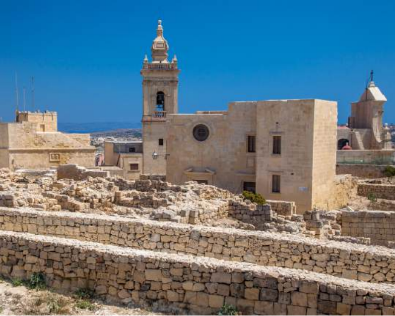
Ġgantija Temples, Gozo, Malta

Option 2: Explore the villages of Mdina , Malta's ancient capital known for its medieval fortifications and Baroque architecture, and Rabat , home to early Christian catacombs and the legendary St. Paul's Grotto , where St Paul the Apostle is believed to have founded the first Christian Community on the island.