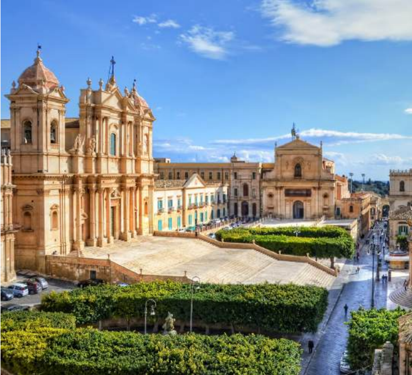
Noto Cathedral, Noto, Sicily

Extend your adventure by exploring Taormina, Sicily, on an optional prelude. Dates, details, and pricing will be shared at a later date.