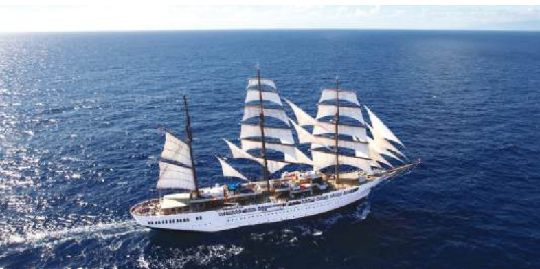
Sea Cloud II

Sea Cloud II is a three-masted sailing yacht steeped in the elegance of yesteryear and complemented with the most modern amenities. Sister ship of the legendary Sea Cloud , Sea Cloud II has 47 outside cabins and travels under 23 billowing sails trimmed by hand. From the mahogany-paneled library and gracious lounge to the gym and watersports platform, no detail has been overlooked. Praised by the world's most discerning travelers, Sea Cloud II receives consistently high rankings from Condé Nast Traveler . Passengers enjoy open seating at all meals and complimentary use of all water sports equipment. A doctor is on call 24 hours a day. Please note that there is no elevator on Sea Cloud II .