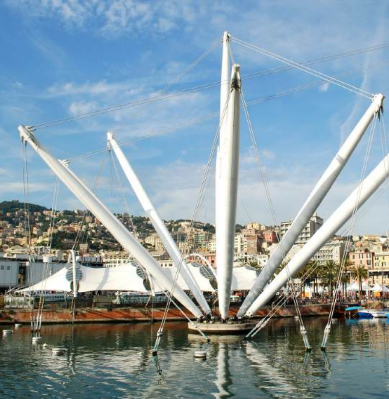
Portico Antico designed by Renzo Piano, Genoa, Italy