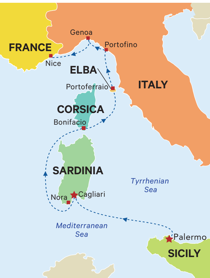
Map of the region (above)

Extend your adventure with an optional prelude in Palermo, Sicily, exploring the city's most famous, UNESCO-listed Arab-Norman monuments including the Palazzo dei Normanni and its splendid 12th-century Cappella Palatina.