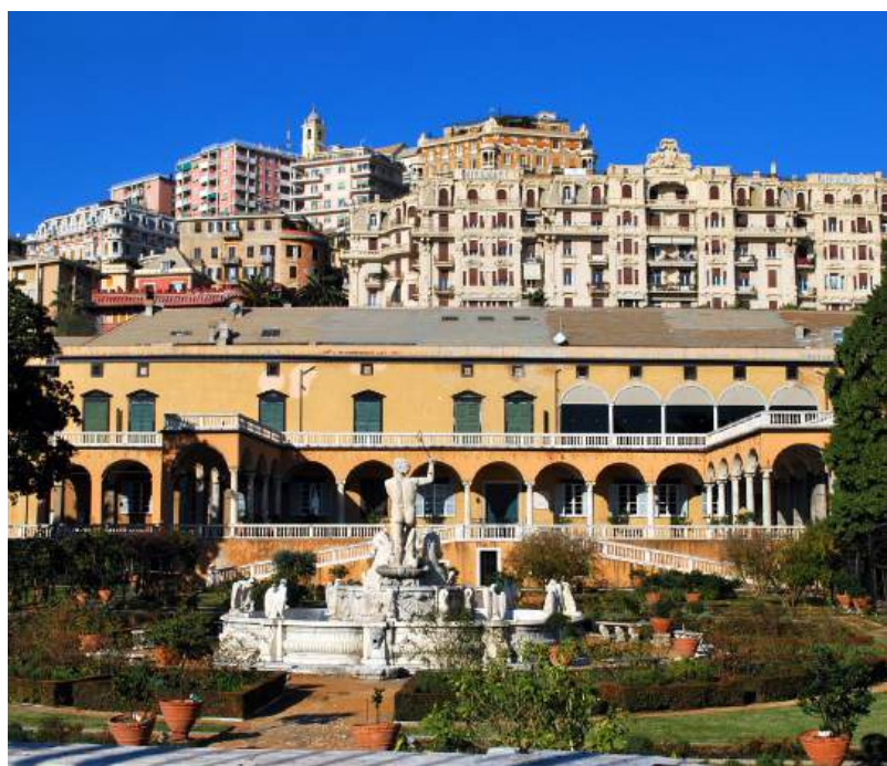
Villa del Principe, Genoa, Italy

DISCLAIMER: This itinerary is subject to change at the discretion of Arrangements Abroad. For complete details, please carefully read the terms and conditions at www.arrangementsabroad.com/terms .