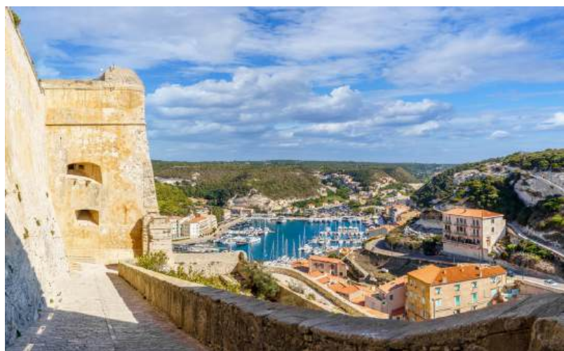
Bonifacio, Corsica, France

Stop at the imposing Porte de Gênes , a 12th-century Genoese fortification that stood guard over Bonifacio's citadel for hundreds of years. Pause to gaze at the sea-and-sky panorama that has awed travelers for centuries. Set sail in the evening, and head north to Elba. B,L,D