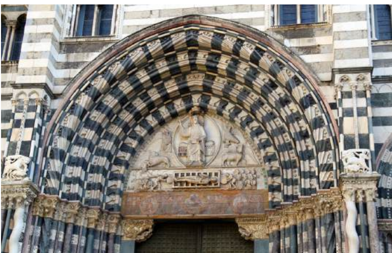
San Lorenzo Cathedral, Genoa, Italy

As your ship docks in Genoa , Italy's busiest port, prepare for a day of Renaissance grandeur mixed with modern innovation. Begin at the Porto Antico , where native architect Renzo Piano transformed the ancient harbor into a vibrant waterfront. Ascend 131 feet in Piano's Il Bigo lift for breathtaking views of the city and sea.