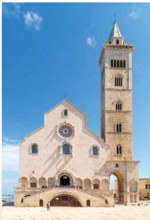
Cathedral of St. Nicholas, Trani