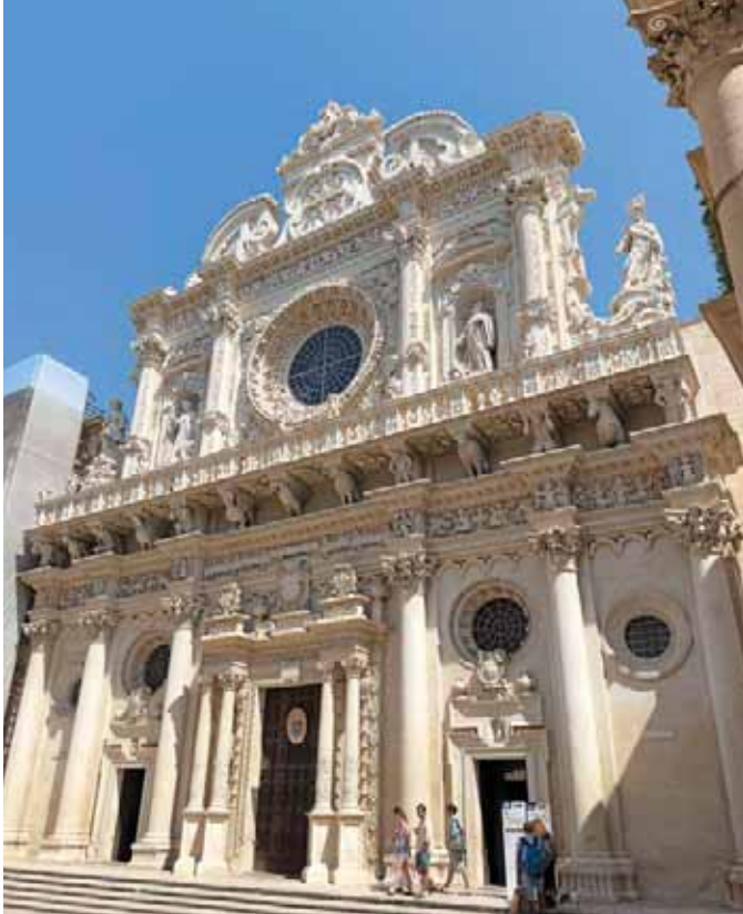
The magnificent baroque architecture of the Basilica of Santa Croce, Lecce