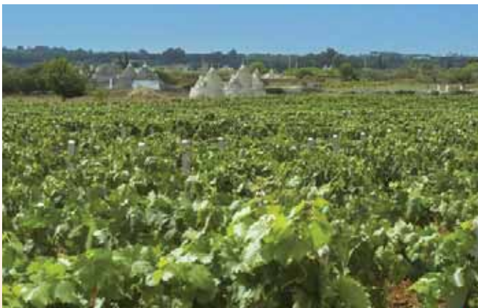
Vineyards and trulli in the countryside near Alberobello