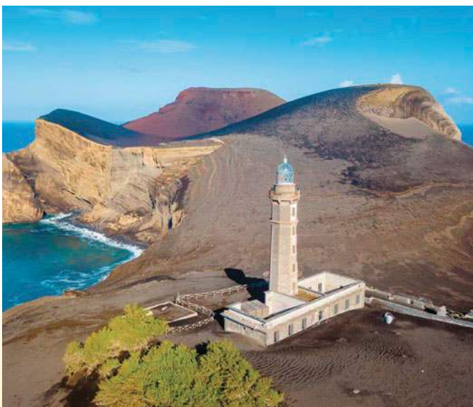
Capelinhos Volcano & Interpretation Center