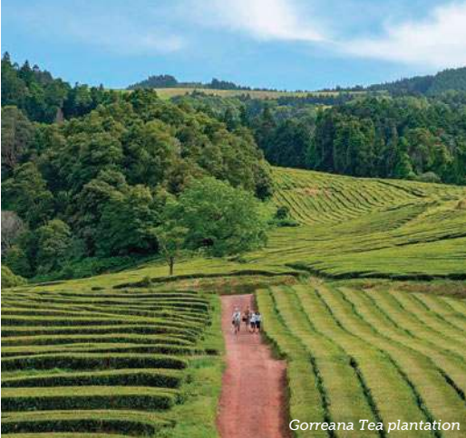
Correana Tea plantation