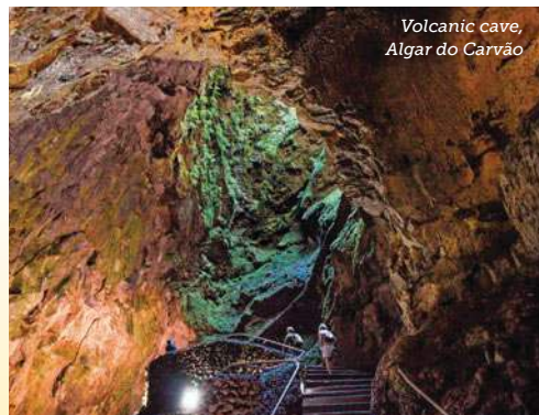
Volcanic cave, Algar do Carvão

Whale Watching. Embark on a thrilling boat expedition to look for sightings of majestic, graceful whales and playful dolphins in one of the world's largest whale sanctuaries.