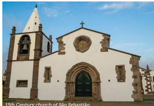
15th Century church of São Sebastião