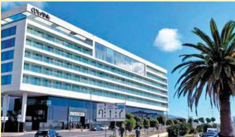
Octant Ponta Delgada | Ponta Delgada, São Miguel Island