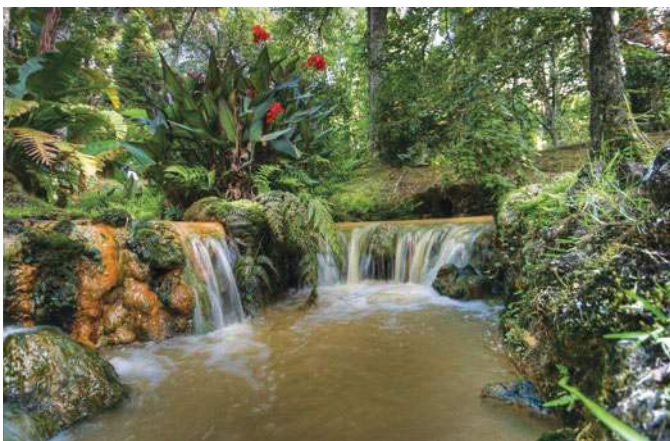
Terra Nostra Park