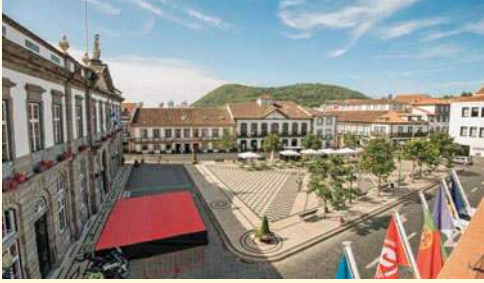
Azoris Angra Garden | Heroísmo, Terceira Island