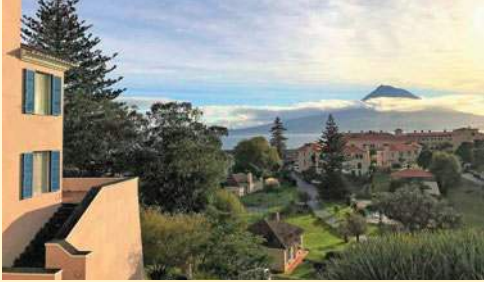
Azoris Faial Garden | Horta, Faial Island