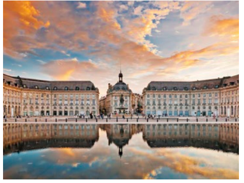
Miroir d'Eau, Place de la Bourse

Laguardia. Soak up the wonderful ambience of the capital of Spain's Rioja Alavesa wine region on a guided walk. See the medieval fortifications, the Romanesque church, the Plaza Mayor and the underground tunnels.