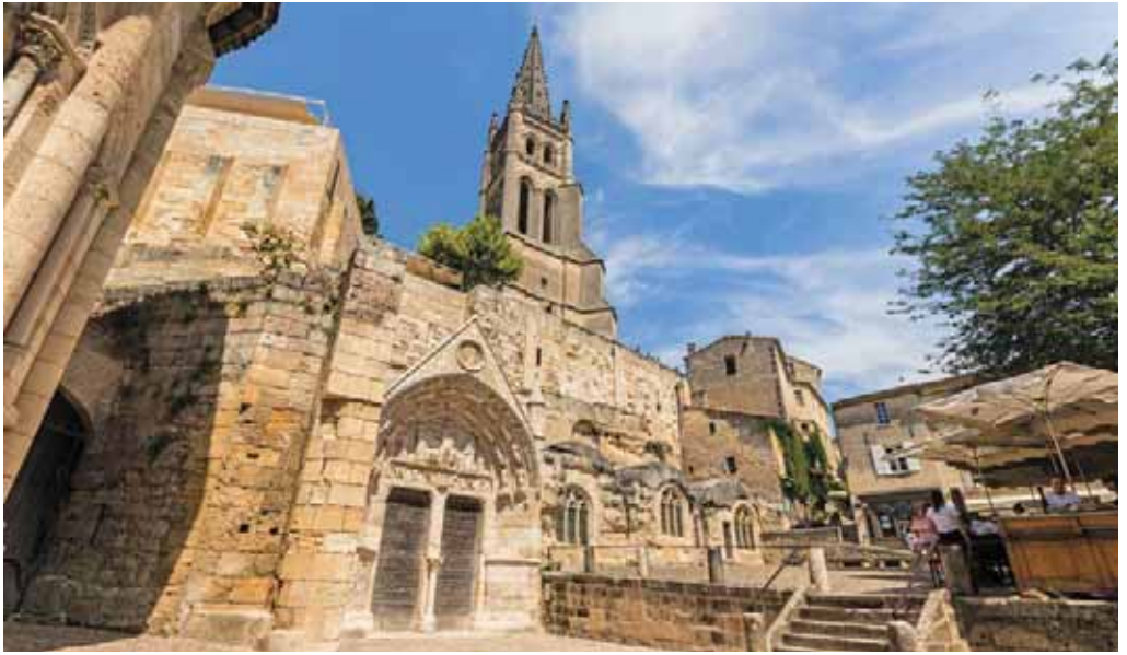
Monolithic Church, Saint-Émilion