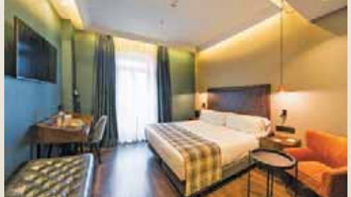
Catalonia Donosti Hotel | San Sebastián