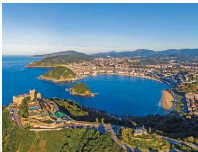
La Concha Bay, San Sebastián