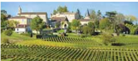
Jurisdiction of Saint-Émilion