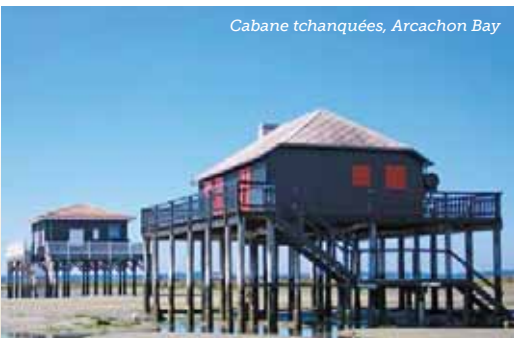
Cabane tchanquéés, Arcachon Bay

San Sebastián. Called Donostia in Basque, San Sebastián became known as a resort town when Queen Isabella II chose it as her summer seaside retreat in the mid-1800s. Spanish royalty and aristocrats followed, and the city expanded with grand Belle Époque buildings. See its highlights, including the 18th-century, baroque Basilica de Santa María del Coro , on a guided walk through the buzzing old town and along the waterfront promenade by spectacular La Concha Bay .