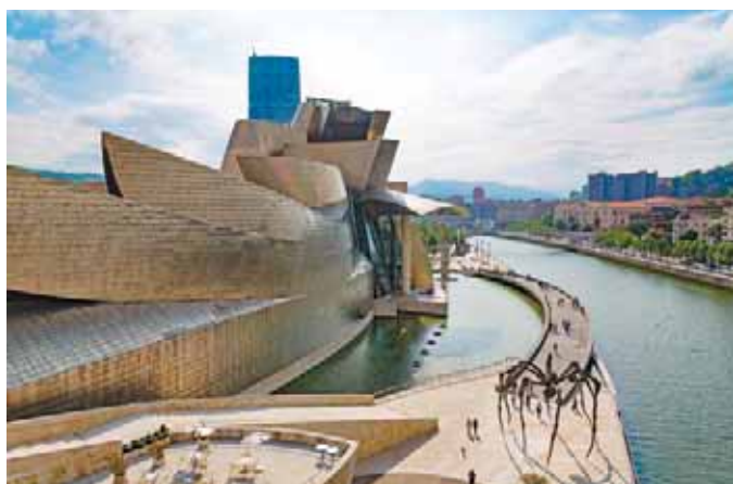
Guggenheim Museum, Bilbao