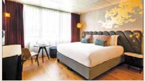
Renaissance Bordeaux Hotel | Bordeaux