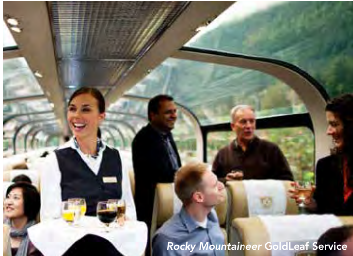
Rocky Mountaineer GoldLeaf Service