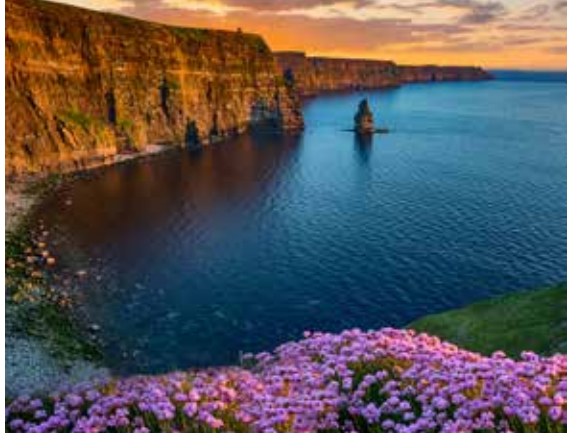
Cliffs of Moher