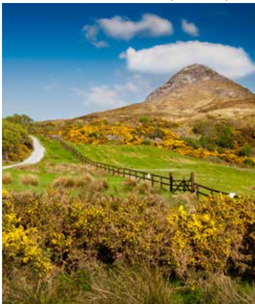
Connemara National Park