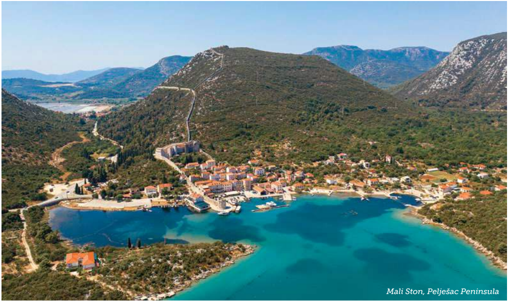
Mali Ston, Peleješac Peninsula