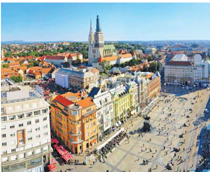
Ban Jelačić Square, Zagreb