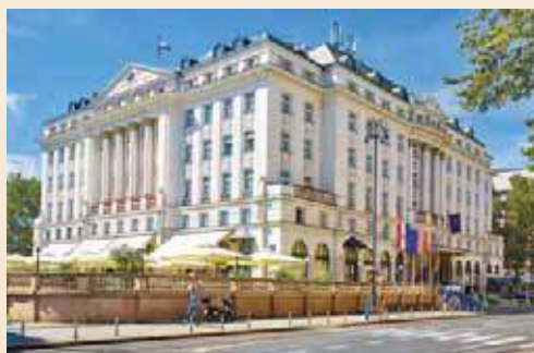
Esplanade Zagreb Hotel | Zagreb