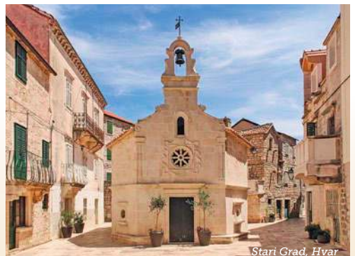
Stari Grad, Hvar

Cultural Šibenik. Uncover the proud city of Šibenik on a guided tour to see its winding alleys, squares and striking buildings. Visit the Cathedral of St. James, one of Europe's most