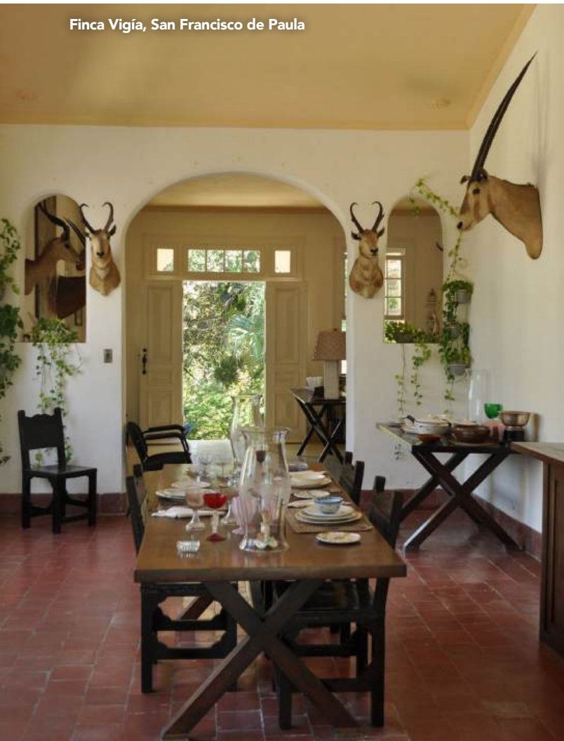
Finca Vigía, San Francisco de Paula