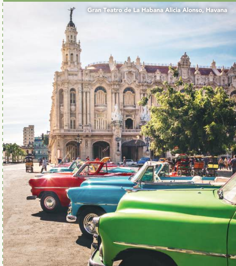
Gran Teatro de La Habana Alicia Alonso, Havana