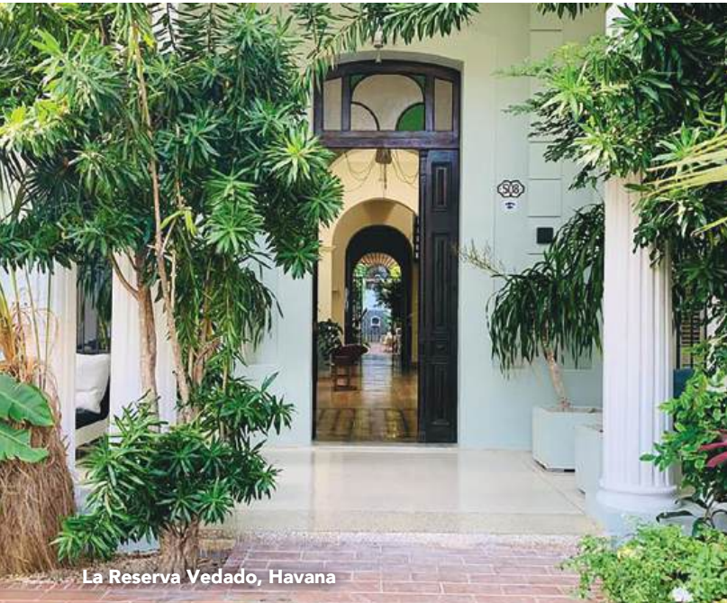
La Reserva Vedado, Havana

Experience Havana's rich heritage at this privately owned boutique hotel. Set in a meticulously restored historic residence, La Reserva Vedado blends Old Havana's architectural elegance with contemporary Cuban art and modern design. Stay connected with complimentary Wi-Fi and unwind with expertly crafted mojitos and traditional Cuban cuisine at the hotel's bar and restaurant.