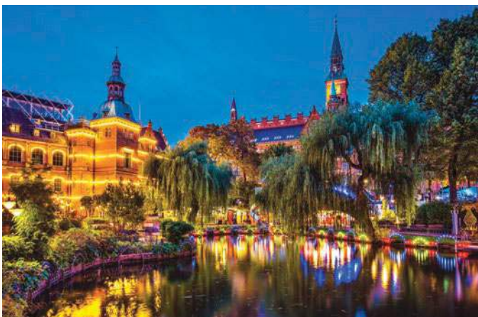
Tivoli Gardens, Copenhagen