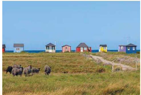
The shoreline of Vesterstrand Beach on Ærø Island is dotted with charming, traditional beach huts, treasured properties that are often handed down from generation to generation.

Silkeborg. Take a guided walk in this vibrant town nestled in Denmark's lush Lake District, and visit the Silkeborg Museum, notable for the remarkably well-preserved Tollund Man and Elling Woman from the fifth century B.C. Savor smørrebrød, traditional Danish open-faced sandwiches, for lunch at a restaurant.