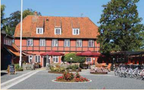
Hotel Ærøhus | Ærøskøbing