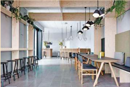
Comwell Aarhus – Dolce by Wyndham | Aarhus