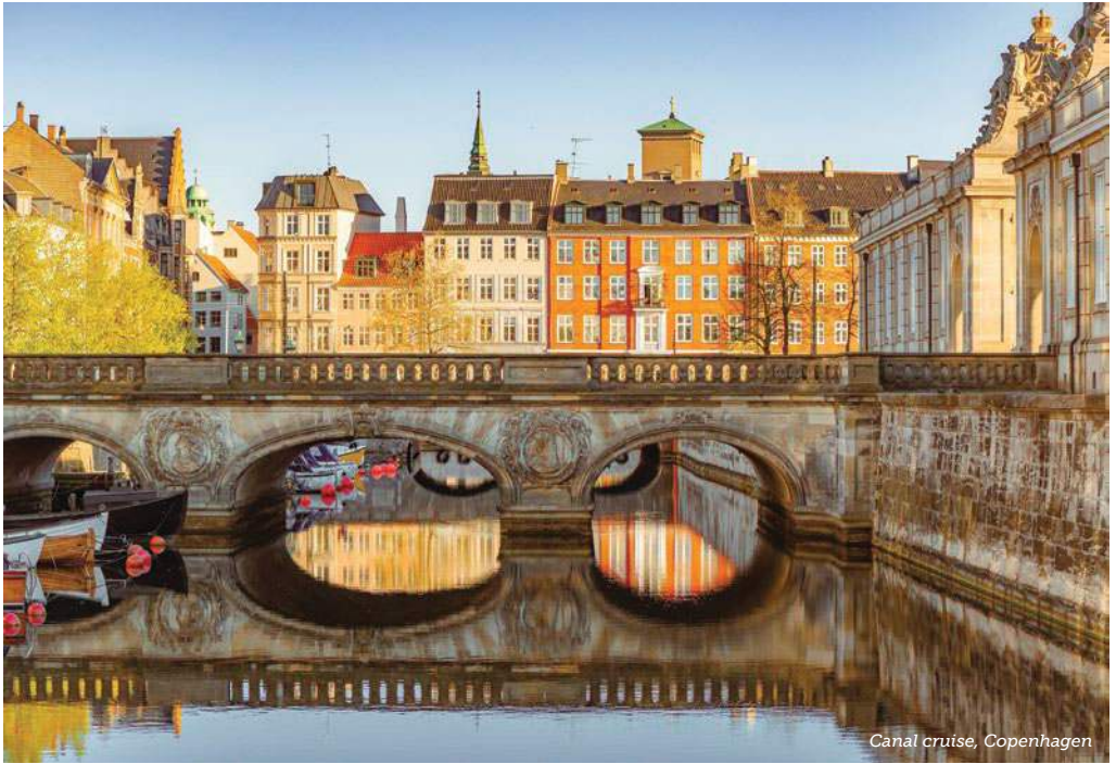
Canal cruise, Copenhagen