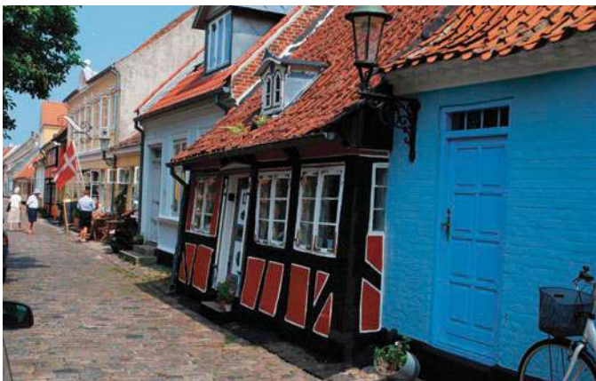
Historic houses of Ærøskøbing