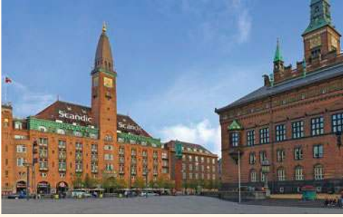
Scandic Palace Hotel | Copenhagen