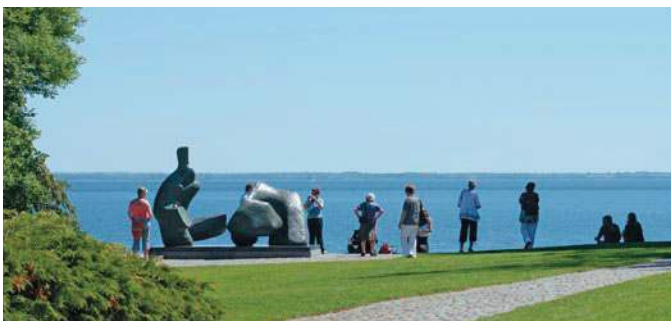
Sculpture Park, Louisiana Museum of Modern Art