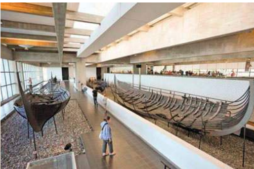
Viking Ship Museum

Travel to Aarhus and check in to your hotel.