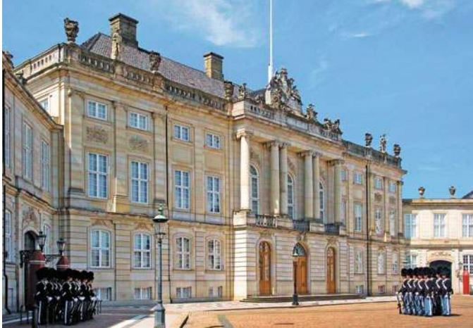
Amalienborg Palace, Copenhagen