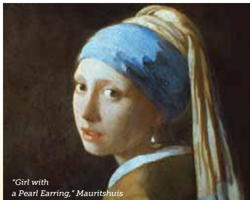
"Girl with a Pearl Earring," Mauritshuis