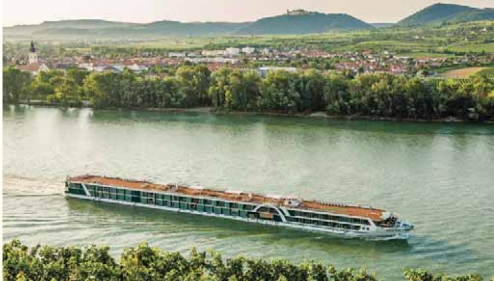
MS Amadeus Queen