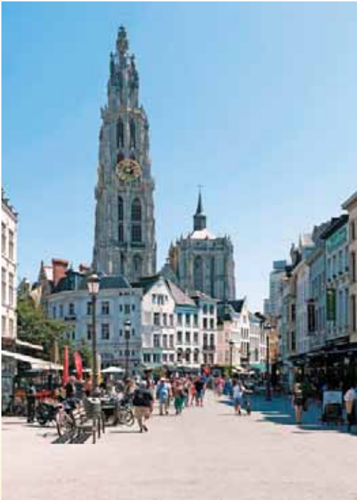
Cathedral of Our Lady, Antwerp