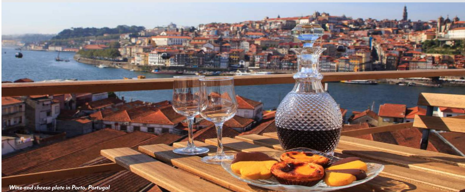
Wine and cheese plate in Porto, Portugal