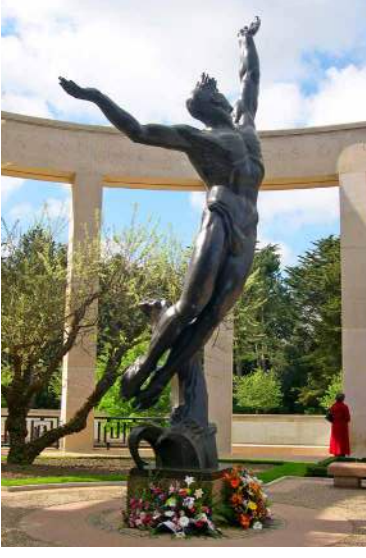
Normandy American Cemetery, France

Return to the ship and share your day's experiences over dinner with friends.