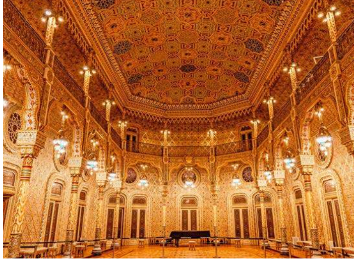
Stock Exchange Palace, Porto, Portugal