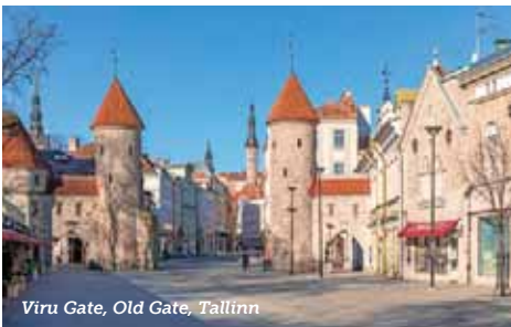
Viru Gate, Old Gate, Tallinn

Historic Center (Old Town) of Tallinn, Estonia