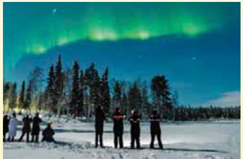
Northern Lights Village | Pyhä