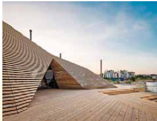
Löyly Sauna, Helsinki

Arktikum. This engaging science center and history museum in Rovaniemi delves into the unique aspects of life in the Arctic. On a guided tour, view fascinating exhibits about the culture, history, wildlife and natural environment of northern Lapland.