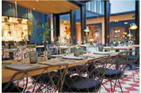
Hotel U14 | Helsinki