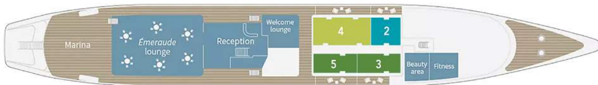
HORIZON DECK Marina, lounge, reception and welcome lounge, beauty and fitness areas, staterooms 2-5