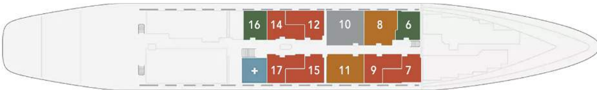
AZURE DECK Infirmary, staterooms 6-16