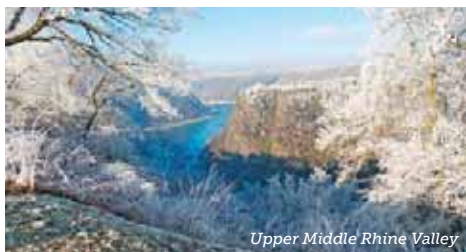
Upper Middle Rhine Valley

The National Trust for Historic Preservation is a private, nonprofit membership organization dedicated to saving historic places and revitalizing America's communities. For more information, visit the Trust's website at www.savingplaces.org .