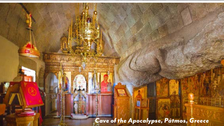
Cave of the Apocalypse, Pátmos, Greece