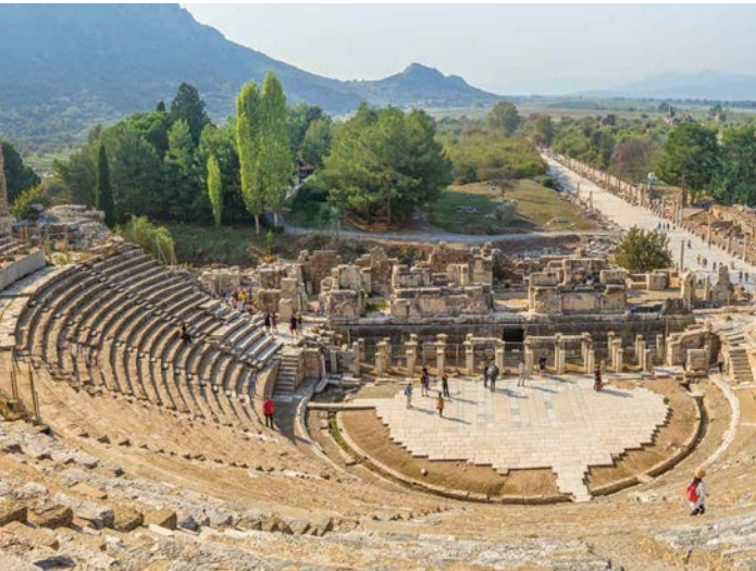
Great Theater, Ephesus, Turkey

Be on deck as your ship glides to breathtaking Santorini, one of the most iconic islands in the Aegean Sea. You'll be greeted by stunning whitewashed buildings perched above the sea and a caldera rising dramatically from the water. Some believe this location was the inspiration for the legendary lost city of Atlantis. From the port, drive to the southern end of the island to explore the prehistoric settlement of Akrotiri. Tour these