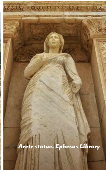
Arete statue, Ephesus Library