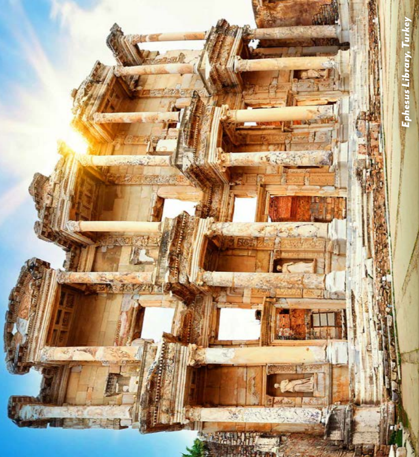
Ephesus Library, Turkey