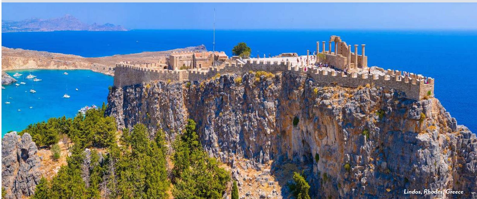
Lindos, Rhodes, Greece