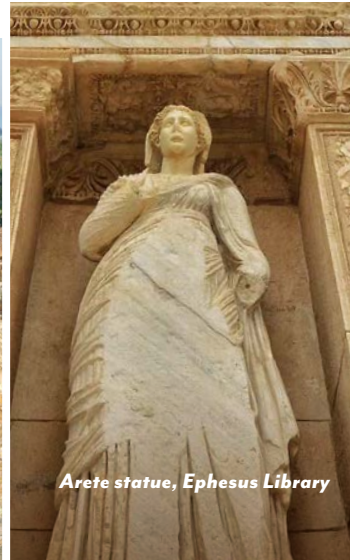
Arete statue, Ephesus Library