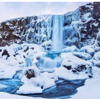
Þingvellir National Park, Iceland

Enjoy a scenic drive to Akureyri, the “capital of the north.” With a population of under 20,000, Akureyri is a compact and welcoming city with fabulous scenery. Stop