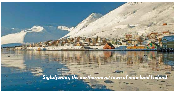
Siglufjörður, the northernmost town of mainland Iceland

Step into Siglufjörður’s past as a tiny fishing hub at the Herring Era Museum, featuring a restored salt house and factory. After, travel to Hauganes, a small fishing village on the western