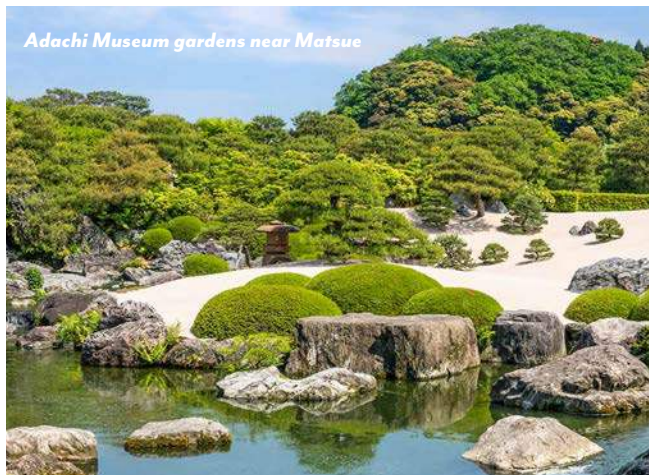
Adachi Museum gardens near Matsue