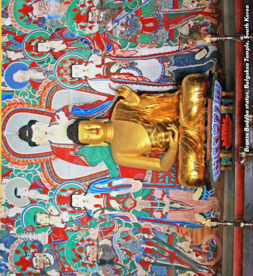
Bronze Buddha statue, Bulguksa Temple, South Korea

SPECIAL SAVINGS* AVAILABLE SAVE $2,000 PER COUPLE!