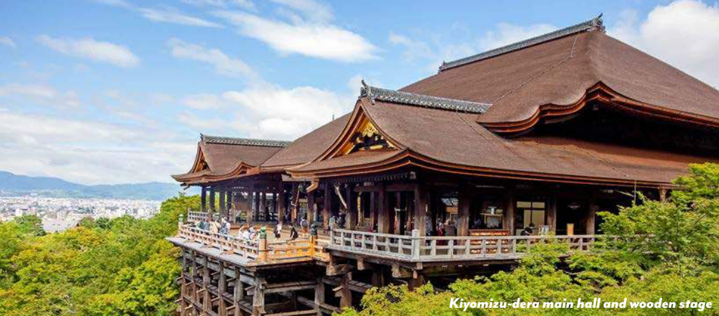
Kiyomizu-dera main hall and wooden stage