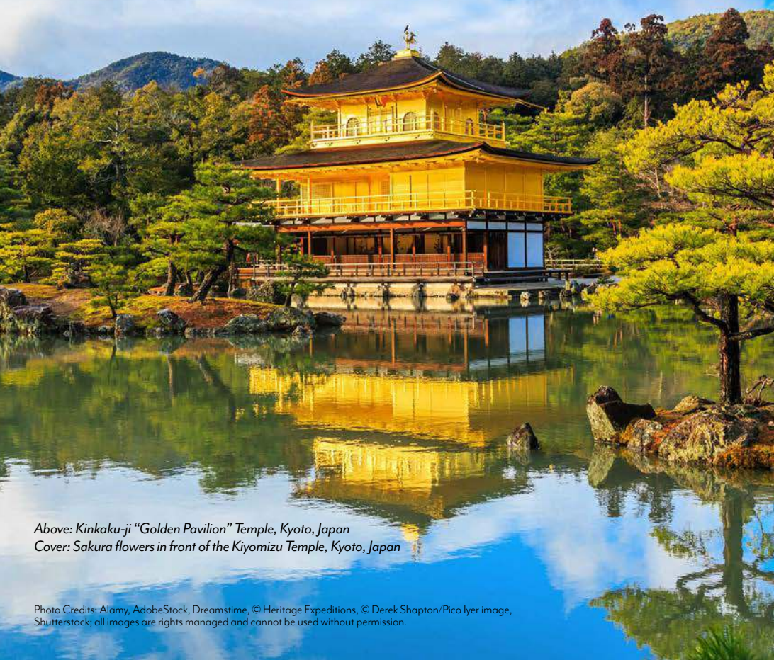
Above: Kinkaku-ji “Golden Pavilion” Temple, Kyoto, Japan Cover: Sakura flowers in front of the Kiyomizu Temple, Kyoto, Japan