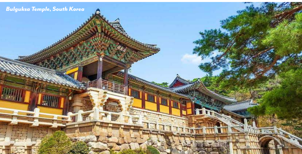
Bulguksa Temple, South Korea

This historic port city is an important international trade hub set on a natural harbor at the base of rolling mountains. Like Hiroshima, its name is synonymous with the atomic bombing that took place here in 1945. Today, choose between two included excursions: visit the Museum of History & Culture and Peace Park and learn its fascinating story. Or tour the Atomic Bomb Museum. This museum covers the bombing as a story, with exhibits