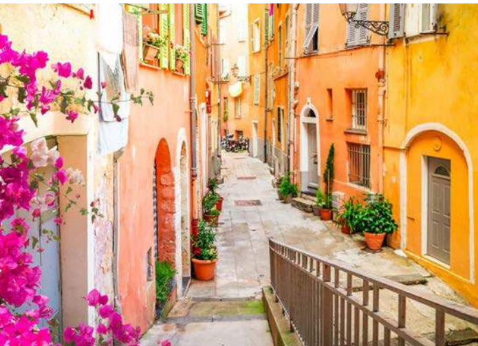
Old Town, Nice, France

then head inland to visit Dolceaqua, a charming medieval village set among forested hills.