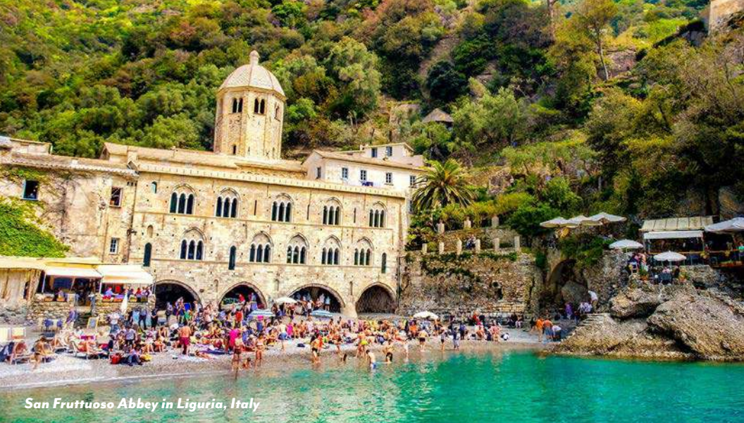
San Fruttuoso Abbey in Liguria, Italy

super-yachts, and the tiny, cobbled streets boast high-end boutiques. Despite being the filming location for many movies, the village retains its natural charm.