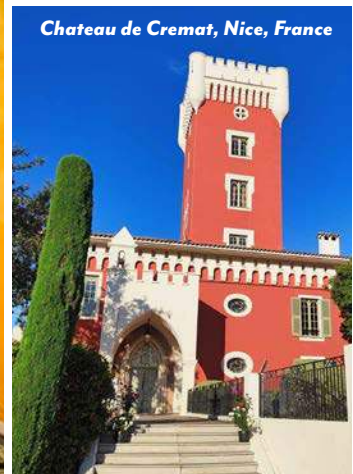
Chateau de Cremat, Nice, France

Doria added on in 1562. This stone watchtower was built to protect residents from menacing Barbary pirates, who threatened the coast. Sail on to the fishing village of Camogli, renowned for its pastel-colored palazzi and houses stacked up along the coastline. In the mid-1800s, the town — known as the City of a Thousand White Sailing Ships — was esteemed for its powerful merchant navy, including a fleet of tall ships. This afternoon, spend free time exploring Portofino. This picturesque village was originally named Portus Delphini (Dolphin Harbor), which evolved into Portofino. Nowadays, the beautiful harbor is filled with