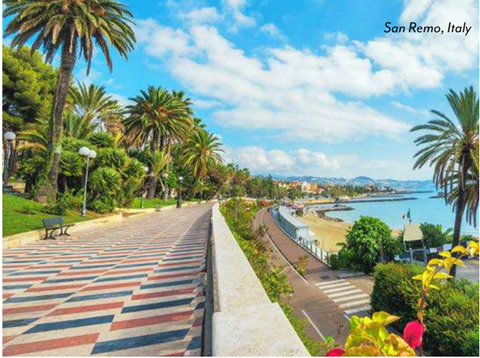
San Remo, Italy

your own plans for lunch. This afternoon, embark the deluxe Sea Cloud Spirit , a unique, luxurious tall ship.