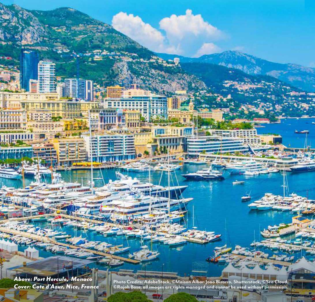
Above: Port Hercule, Monaco Cover: Côte d'Azur, Nice, France

Photo Credits: AdobeStock, ©Maison Albar-Joao Bizarro, Shutterstock, ©Sea Cloud, ©Rajah Bose; all images are rights managed and cannot be used without permission.