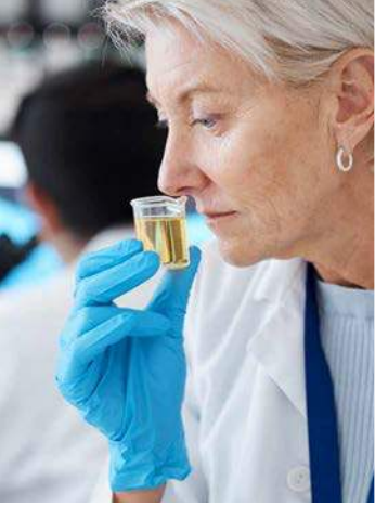
Create your own perfume in Grasse, France