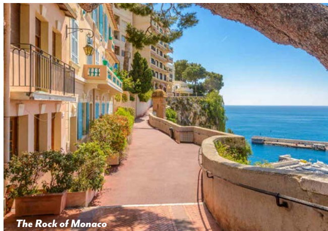
The Rock of Monaco