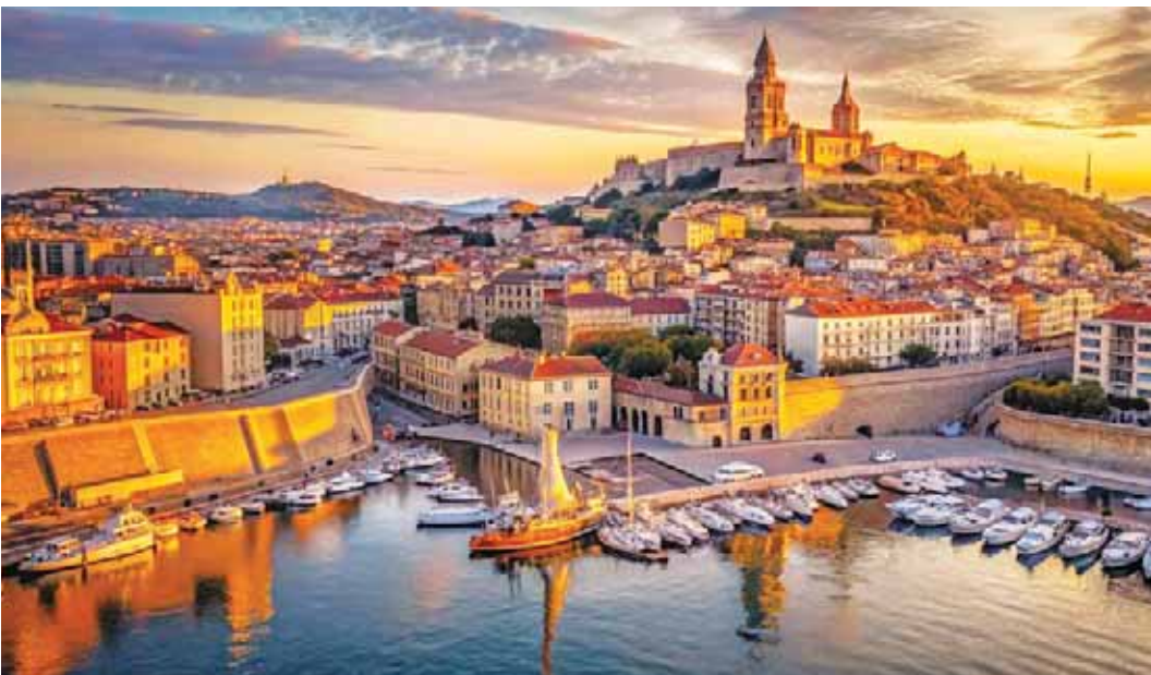
Notre-Dame de la Garde basilica perched above the port of Marseille