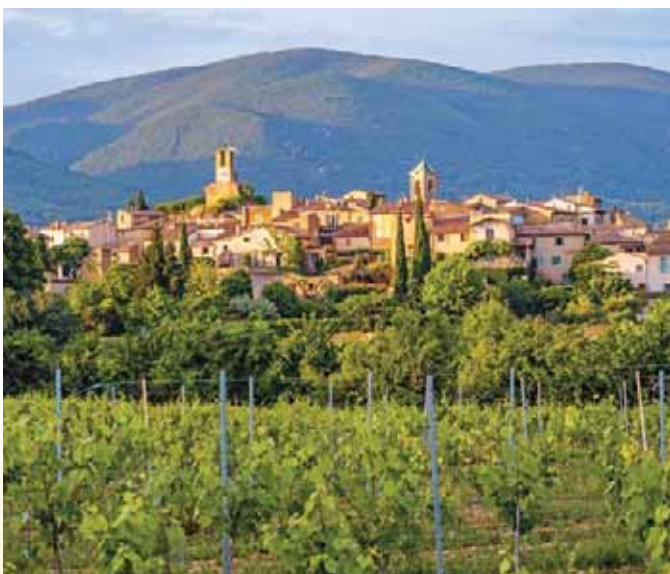
Lourmarin, The Luberon