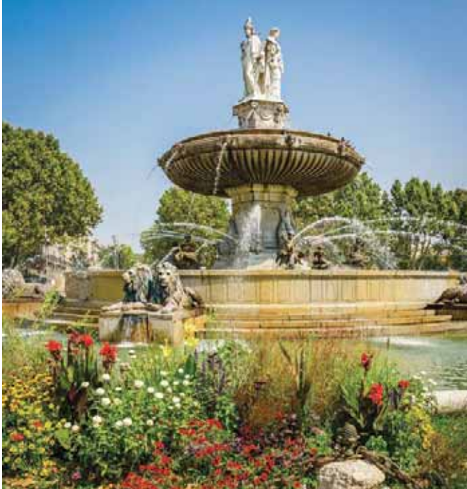
Fontaine de la Rotonde, an historic fountain on Cours Mirabeau, Aix-en-Provence