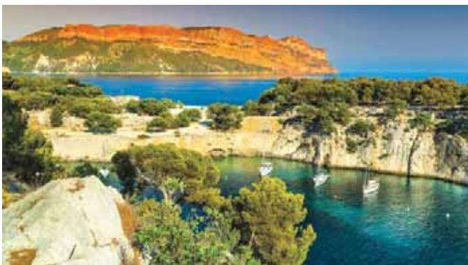
Calanques of Marseille near Cassis