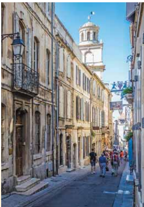
Walking tour of Arles