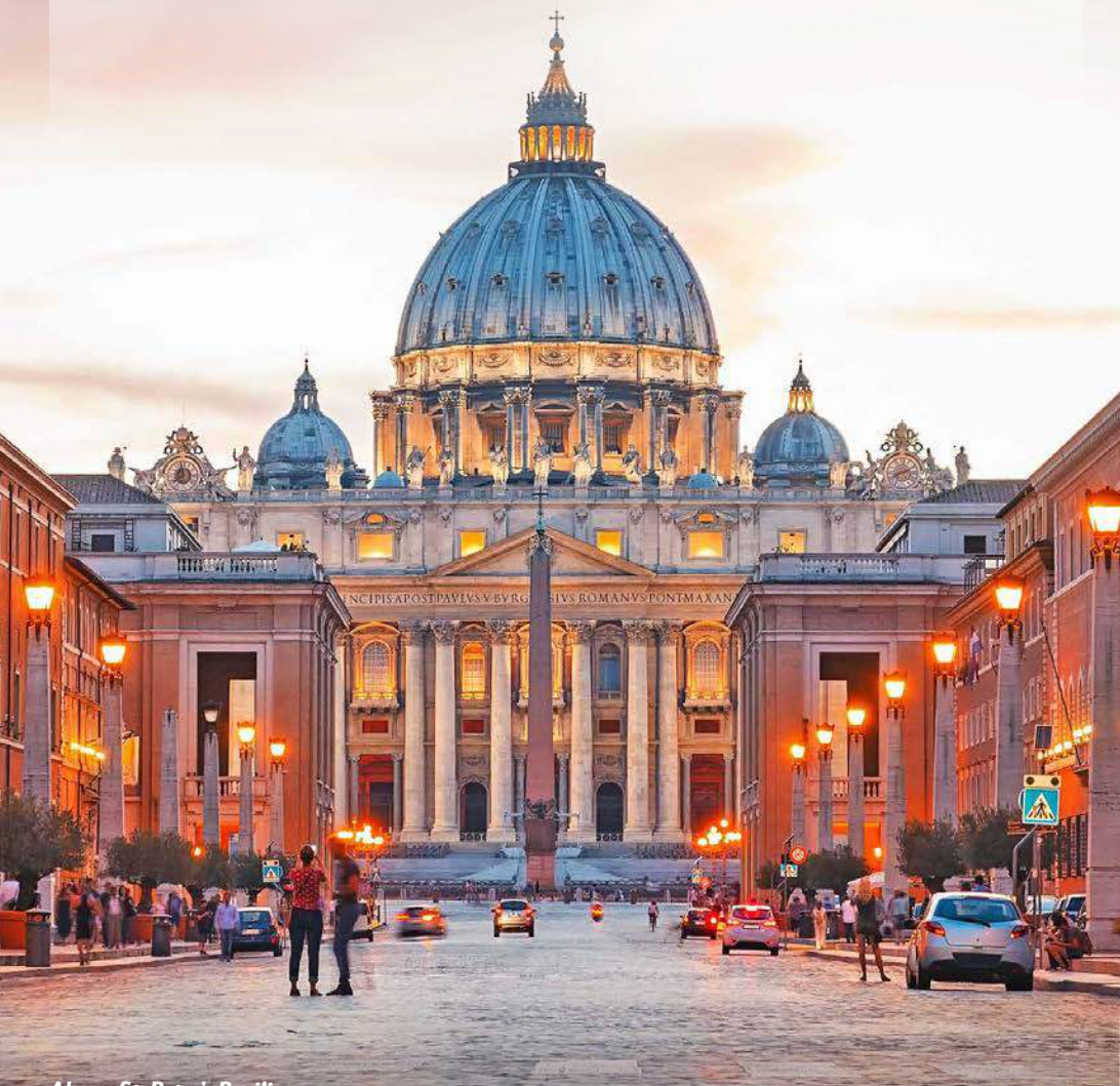
Above: St. Peter's Basilica, Vatican City