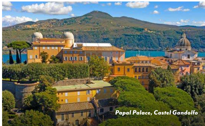
Papal Palace, Castel Gandolfo

early-morning opening of the Vatican Museum and witness the ritualistic unlocking led by the Clavigero. A private tour of the Vatican Museum follows the ritual. Awaken each gallery, including the Gallery of Candelabra, the Gallery of Tapestries and the Gallery of Maps before ending in the incomparable Sistine Chapel. Spend some quiet, reflective moments in the chapel. After breakfast, continue to the splendid St. Peter's Basilica. A new church was commissioned after the original shrine to St. Peter crumbled. All the great Roman Renaissance and baroque architects had input into its