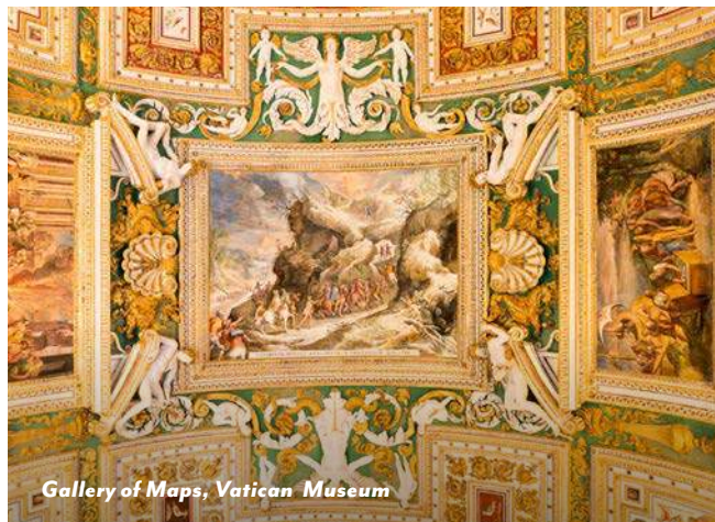
Gallery of Maps, Vatican Museum