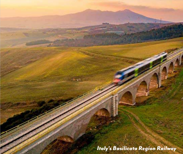
Italy's Basilicata Region Railway

a long history. Painted with bright colors and made to resemble cockerels, Cucù are believed to have magical powers and can be found in many homes in the area.