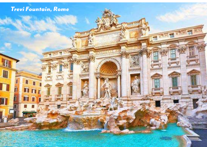
Trevi Fountain, Rome