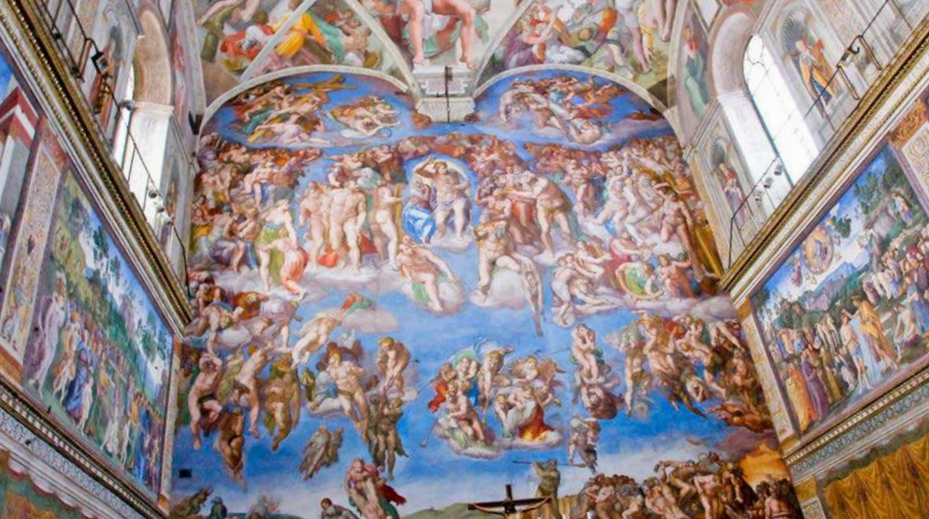
Sistine Chapel, Vatican City

design, and Michaelangelo created the vast dome. Take in the sights and ambience of St. Peter's Square on your own before returning to the hotel.