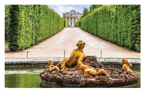
Above: Seine River, Paris | Below: Versailles Palace garden