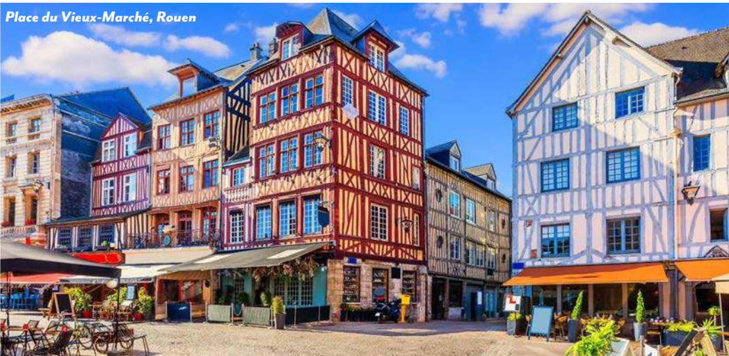
Place du Vieux-Marché, Rouen