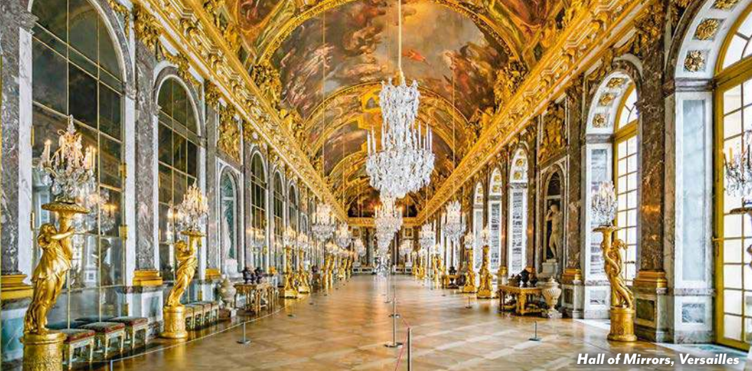
Hall of Mirrors, Versailles