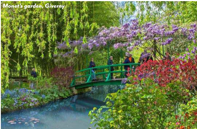
Monet's garden, Giverny

Return to the ship for dinner on board or stay in town for dinner if you wish.