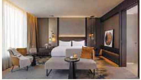
InterContinental Ljubljana | Ljubljana