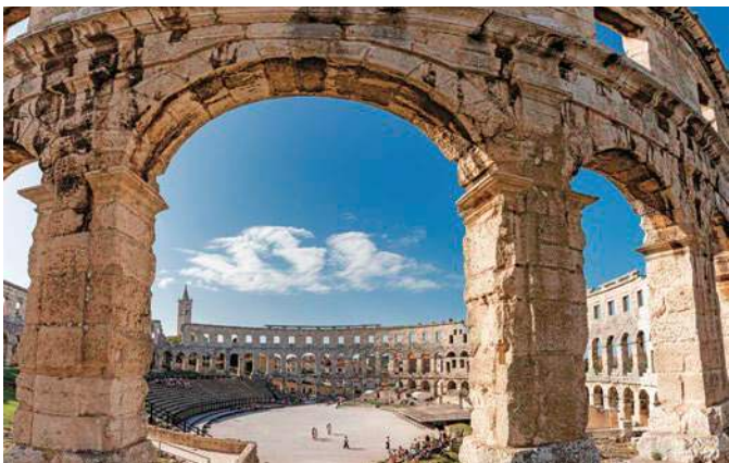
Roman amphitheater, Pula