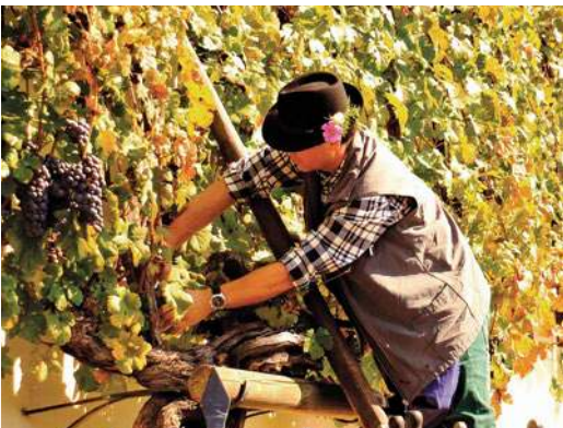
The Old Vine, Maribor

Dinner is on your own this evening. Istrian cuisine is flavorful and fresh.