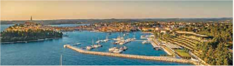
Grand Park Hotel Rovinj | Rovinj