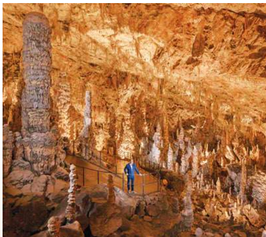
Postojna Cave, Slovenia

Pula & Rovinj. Explore two beloved towns of Istria today, beginning at the coastal city of Pula. Enter Pula's well-preserved Roman theater, the sixth largest of its kind. Stroll through a farmer's market where locals sell fresh fruit, souvenirs, sachets of lavender and truffle products. After an included lunch, head back to romantic Rovinj. The town's small harbor is filled with colorful fishing vessels and flat-bottomed batana boats. Walk through the endearing old town, passing rainbow-hued buildings, Venetian architecture, twisting narrow streets and the Church of St. Euphemia, Istria's largest baroque church.