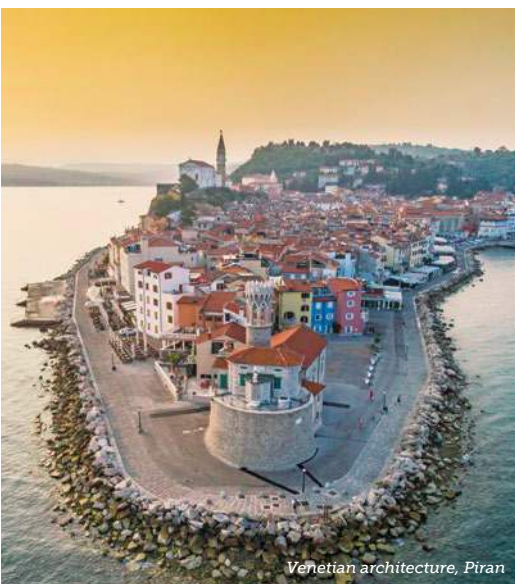
Venetian architecture, Piran