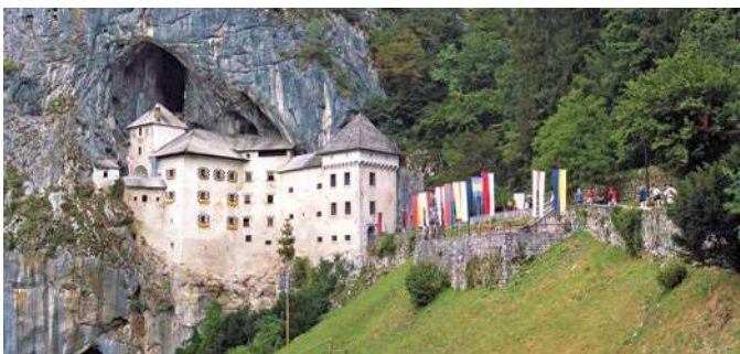
Predjama Castle, Slovenia