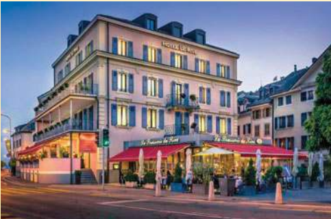
Hotel Le Rive | Nyon