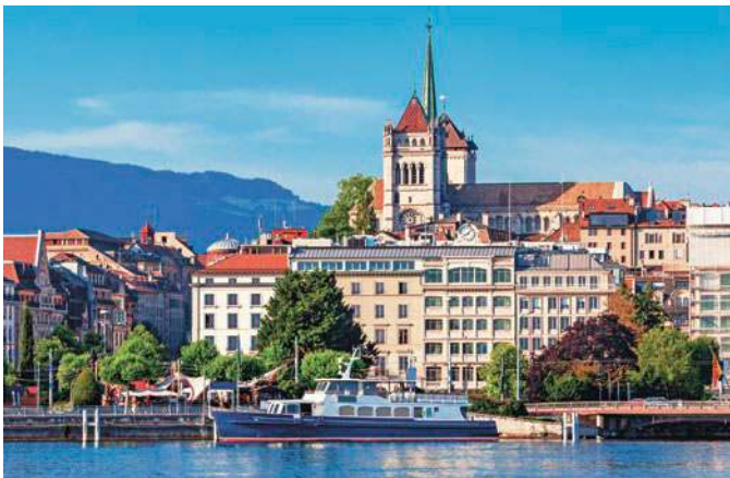
Cruise on Lake Geneva