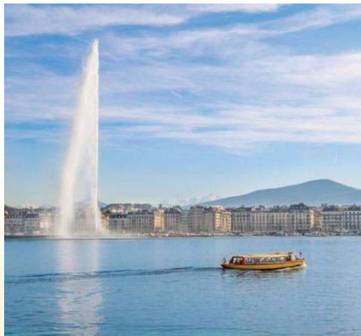
Jet d'Eau, Geneva

Free Time: Make your own discoveries in Geneva. Take a walk by Geneva's Flower Clock, the world's second-largest working clock, relax in Bastion's Park or pick up some