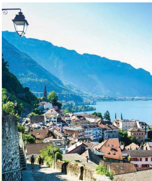
Old Town Montreux