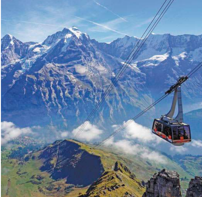
Schilthorn cable car in the Bernese Alps