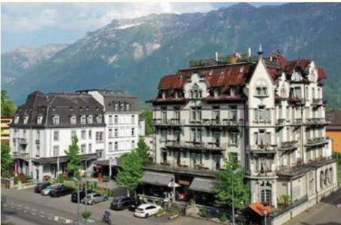
Hotel Carlton-Europe | Interlaken