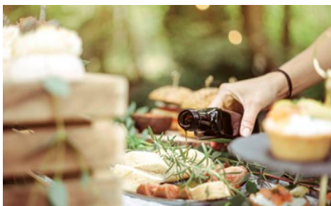
Top: Perugia | Above: Olive oil tasting