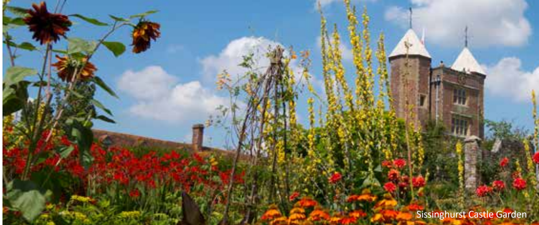
Sissinghurst Castle Garden