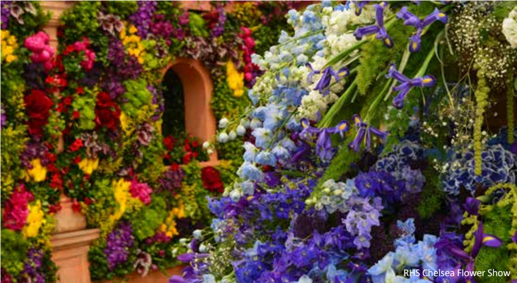
RHS Chelsea Flower Show