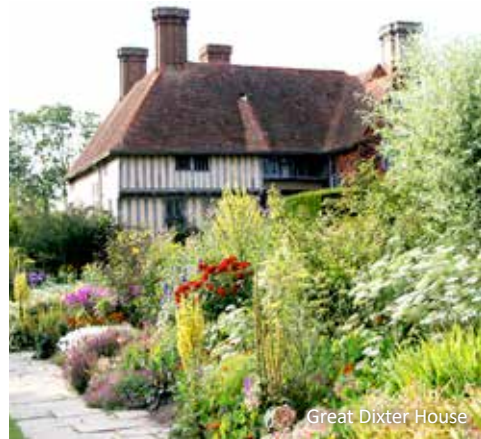
Great Dixter House

Next, lunch and a guided tour await at Great Comp, an RHS Partner Garden surrounding a lovely 17 th -century manor. As one of Kent’s finest horticultural gems, it’s full of stunning plants such as salvias, magnolias, azaleas, rhododendrons and hellebores and also features an Italian Garden, pretty woodland walks plus the Old Dairy Tearooms. Later, we check into the Ashdown Park Hotel & Country Club, where we stay for the next three nights. Meals: Breakfast, Lunch, Dinner