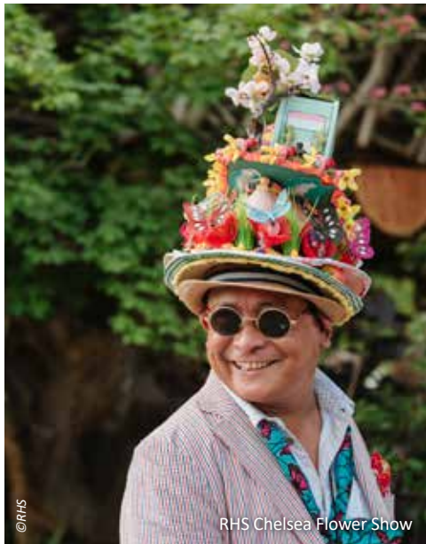
RHS Chelsea Flower Show

Later, we check into the Hyatt Regency London – The Churchill, where we stay for the last three nights of our tour. A springtime stroll is the order of the afternoon with a guided walking tour of the Royal Botanic Gardens, Kew. Dating back to the early 18 th century as a royal palace, Kew Gardens is now a globally renowned institution for plant-based research. Exploding with color and with no less than 50,000 plants, there is a range of different areas to explore including the Arboretum, the peaceful Japanese garden and the remarkable indoor rainforest climbing within the Palm House. Meals: Breakfast