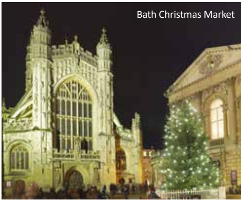
Bath Christmas Market

After checking out of the hotel we head to Bath, an elegant Regency city graced with wonderfully well-preserved Georgian architecture. The Roman Baths are a must-see attraction in Bath, offering a fascinating glimpse into the city’s ancient past. This historic site consists of the remains of one of the greatest religious spas of the ancient world, where natural hot springs still flow with steaming water. We enjoy a guided tour of the magnificent Great Bath, the Sacred Spring, and the Roman Temple, all while learning about the daily life and rituals of the Romans through interactive exhibits and artifacts.