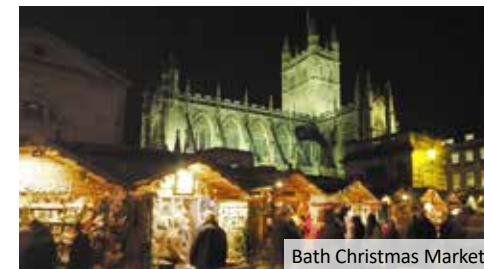
Bath Christmas Market

We start our day with a visit to Windsor Castle, the oldest and largest inhabited castle in the world and the final resting place of Elizabeth II. Established in the 11 th century by William the Conqueror, it has been remodeled by successive kings and queens and is regularly used for ceremonial and state occasions. The magnificent State Apartments are furnished with some of the finest works of art for you to admire, beautifully decorated at this time of year. We find out more of the castle's history on our audio-guided tour.