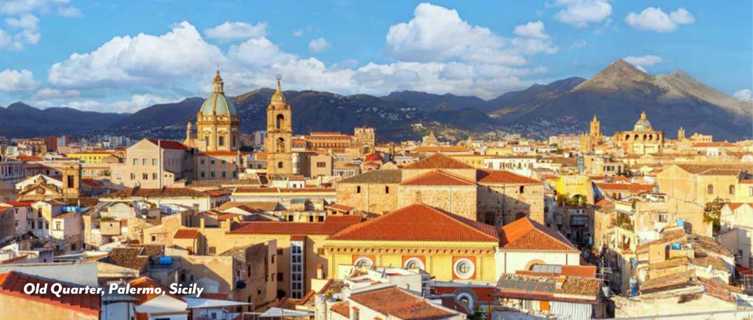
Old Quarter, Palermo, Sicily

Syracuse's most important ruins and the Teatro Greco or enjoy a slower pace by savoring wine tastings at a country winery in the rolling hills of the Val di Noto.