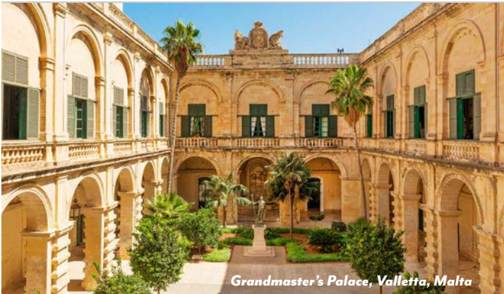
Grandmaster's Palace, Valletta, Malta