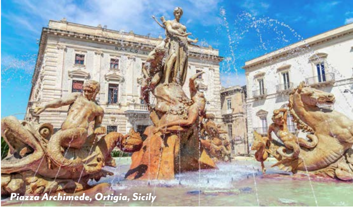
Piazza Archimede, Ortigia, Sicily