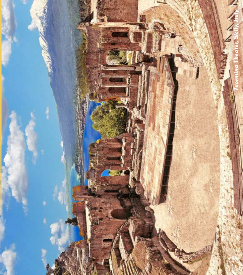
Teormina Theater, Sicily, Italy

PRSRT STD U.S. Postage PAID Gohagan & Company