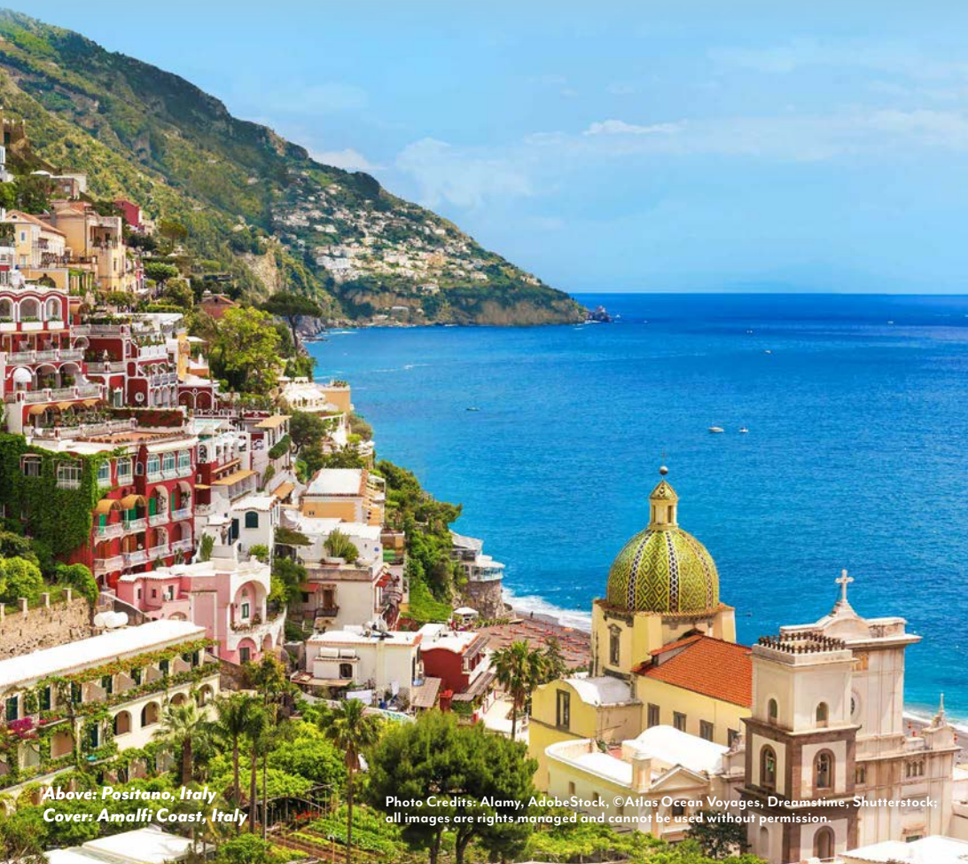
Above: Positano, Italy Cover: Amalfi Coast, Italy

Photo Credits: Alamy, AdobeStock, ©Atlas Ocean Voyages, Dreamstime, Shutterstock; all images are rights managed and cannot be used without permission.