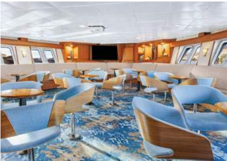
The lounge is the center of life aboard the ship.

Served in single seatings with unassigned tables for an informal atmosphere. Menu emphasizes local fare.