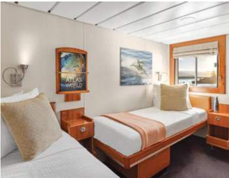
Category 2 cabin with single beds.

All cabins face outside with windows, private facilities, and climate controls. Cabins are equipped with Wi-Fi and multiple electrical and USB outlets. Botanically inspired shampoo, conditioner, shower gel and lotion are all available in cabin bathrooms, as well as an Expedition Essentials Kit. Hair dryers, complimentary insulated water bottles and an atlas are available in each cabin.