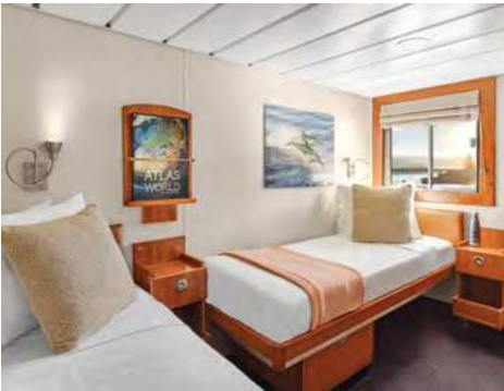
Category 2 cabin with single beds.

All cabins face outside with windows, private facilities, and climate controls. Cabins are equipped with Wi-Fi and multiple electrical and USB outlets. Botanically inspired shampoo, conditioner, shower gel and lotion are all available in cabin bathrooms, as well as an Expedition Essentials Kit. Hair dryers, complimentary insulated water bottles and an atlas are available in each cabin.