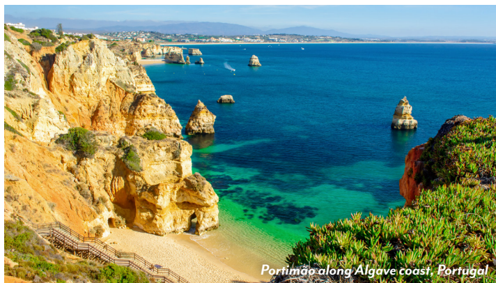
Portimão along Algarve coast, Portugal