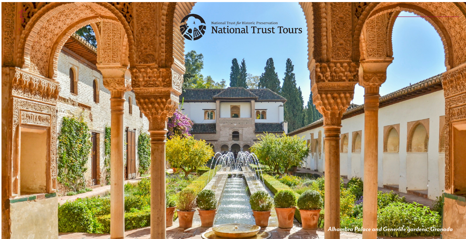
Alhambra Palace and Generalife gardens, Granada

National Trust for Historic Preservation National Trust Tours