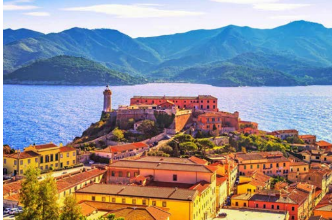
Fort Stella, Elba Island