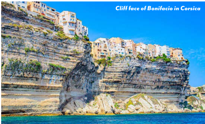
Cliff face of Bonifacio in Corsica