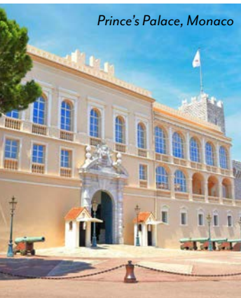
Prince's Palace, Monaco

Spend a leisurely day in Aix-en-Provence, birthplace of Paul Cezanne and known as "City of a Thousand Fountains." Stroll one of the most beautiful streets in France, the elegant Cours Mirabeau Avenue, lined with trees and 17th- and 18th-century mansions. Meander along winding alleys in the historic town center. Soak up lovely