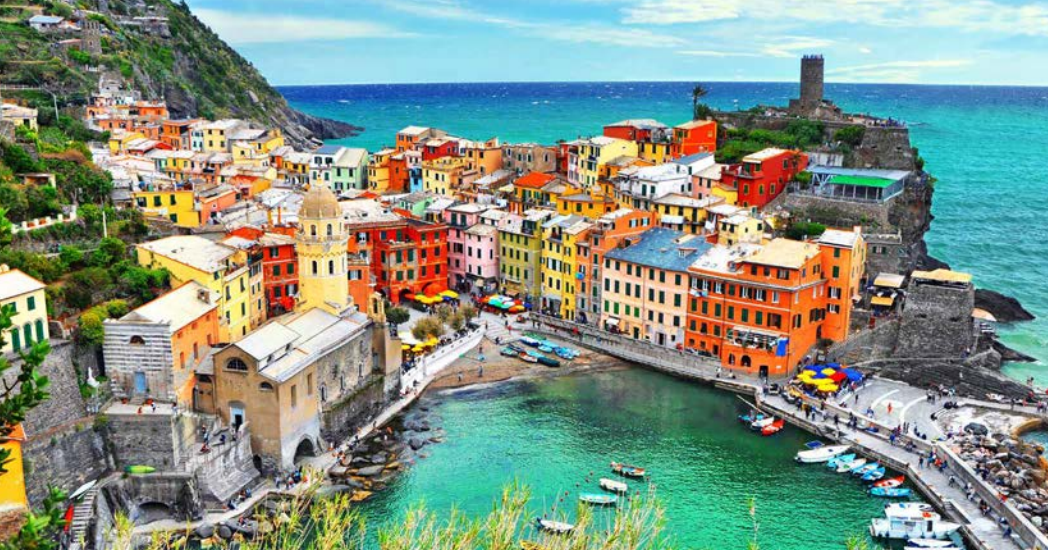
The village of Vernazza in Cinque Terre, Italy

vantage point, the views are unforgettable!