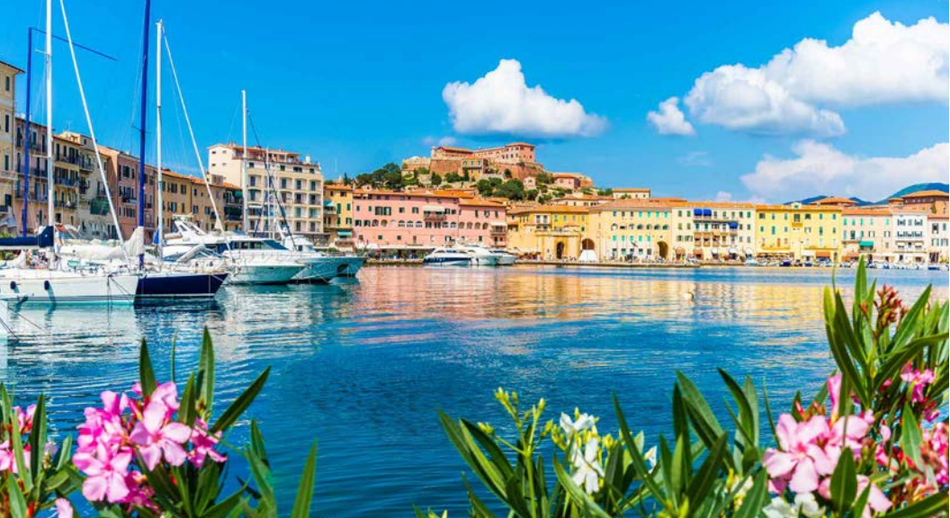
Portoferraio, Elba Island, Italy

architecture, parks, gardens — and of course, fountains — everywhere in this delightful city.