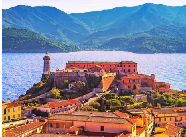
Fort Stella, Elba Island