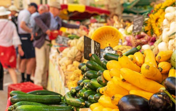
Market in Aix-en-Provence, France

From Mont Boron, enjoy an unbeatable scenic view of the Old Port of Nice, the village of Villefranche-sur-Mer, the Cap-Ferrat peninsula and the famously blue water the Cote d'Azur is named for. Continue on a panoramic tour of some of Nice's most iconic highlights. Savor a delicious lunch on board as the ship sails to Monaco. With an expert local guide, walk through the old town's charming, narrow streets, and admire the historic