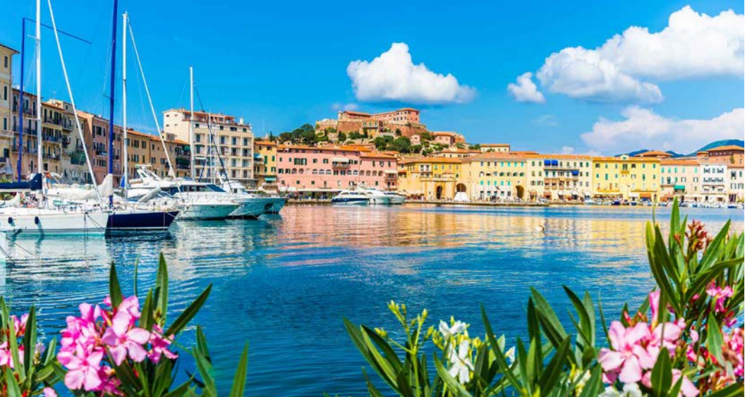
Portoferraio, Elba Island, Italy

and Napoleon's former home of Villa dei Mulini, among other historic sites. Peer through a stone gate with a magnificent sea view. Finish up with a walk along the town's splendid promenade with its exclusive shops and boutiques. B-L-R-D