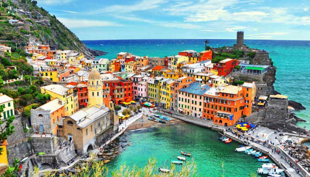
The village of Vernazza in Cinque Terre, Italy

buildings and beautiful architecture and visit the Cathedral where Grace Kelly married Prince Rainier. Tour the Prince's Palace, built as an Italian fortress in A.D. 1191. Marvel at the sumptuous décor in the State Apartments, home to Monaco's royals. Tonight enjoy a relaxing dinner on board, or stay in town for dinner and sightseeing on your own! Shuttles will run from the ship to Monte Carlo throughout the evening.