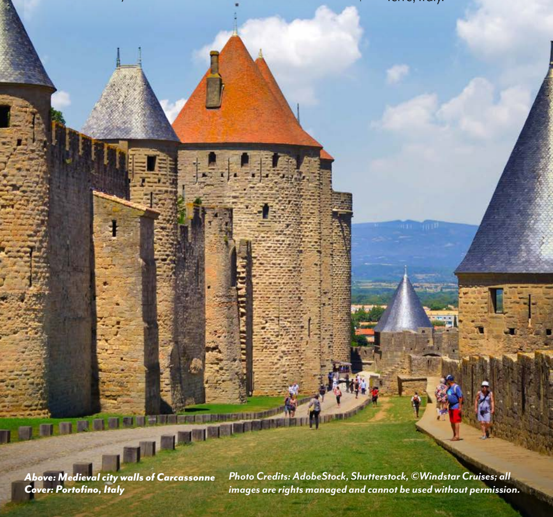
Above: Medieval city walls of Carcassonne Cover: Portofino, Italy

Photo Credits: AdobeStock, Shutterstock, ©Windstar Cruises; all images are rights managed and cannot be used without permission.