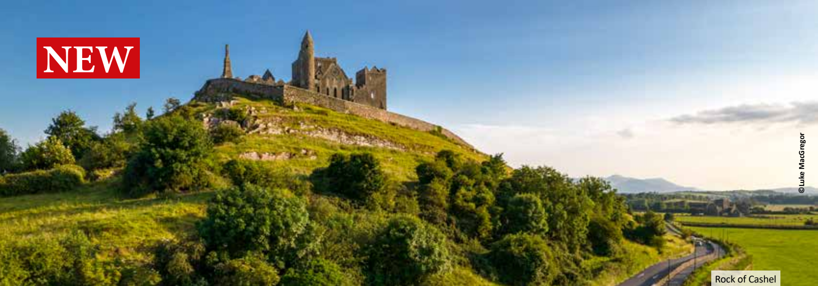
Rock of Cashel