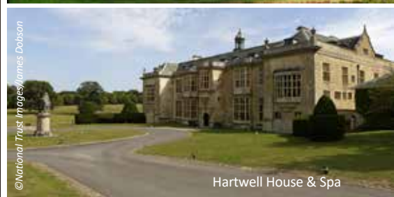
Hartwell House & Spa