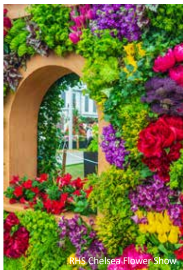
RHS Chelsea Flower Show

PRESORTED STANDARD U.S. POSTAGE PAID LANSDALE, PA PERMIT NO. 491