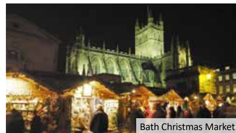
Bath Christmas Market

We start our day with a visit to Windsor Castle, the oldest and largest inhabited castle in the world and the final resting place of Elizabeth II. Established in the 11 th century by William the Conqueror, it has been remodeled by successive kings and queens and is regularly used for ceremonial and state occasions. The magnificent State Apartments are furnished with some of the finest works of art for you to admire, beautifully decorated at this time of year. We find out more of the castle's history on our audio-guided tour.