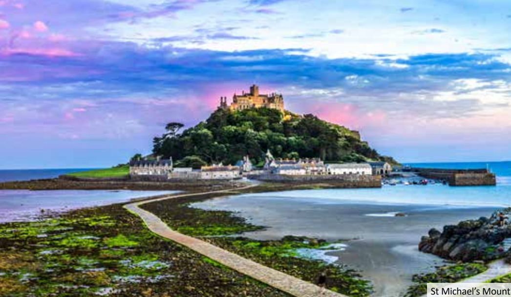
St Michael's Mount