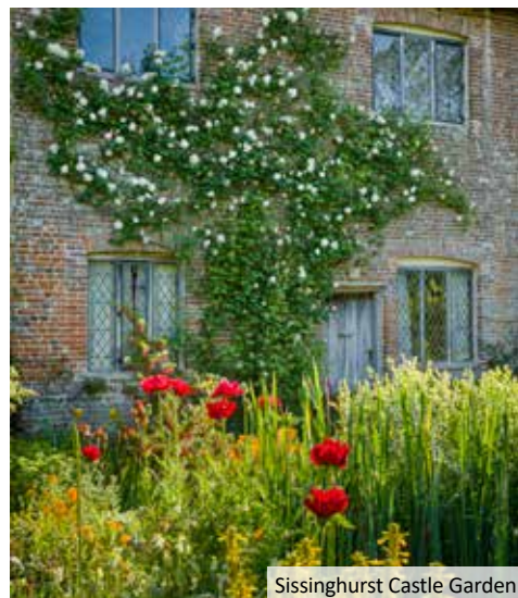
Sissinghurst Castle Garden