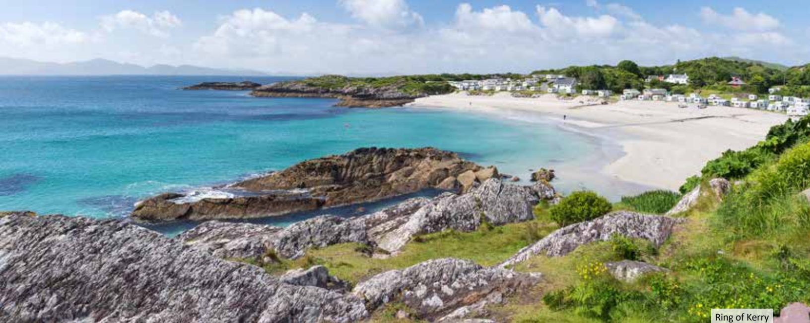
Ring of Kerry