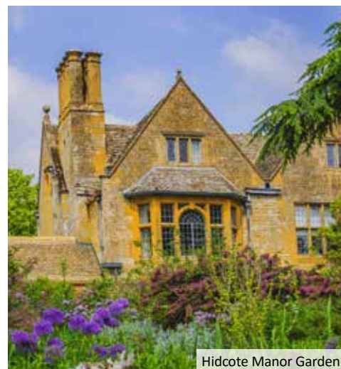
Hidcote Manor Garden