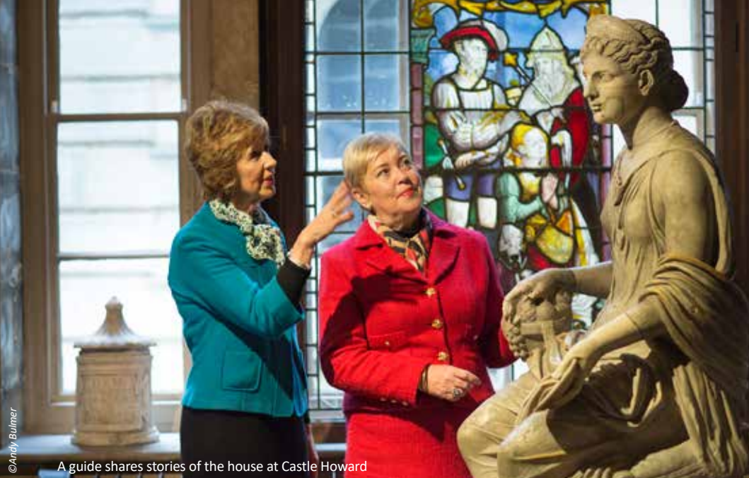
A guide shares stories of the house at Castle Howard