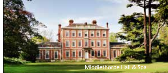
Middlethorpe Hall & Spa