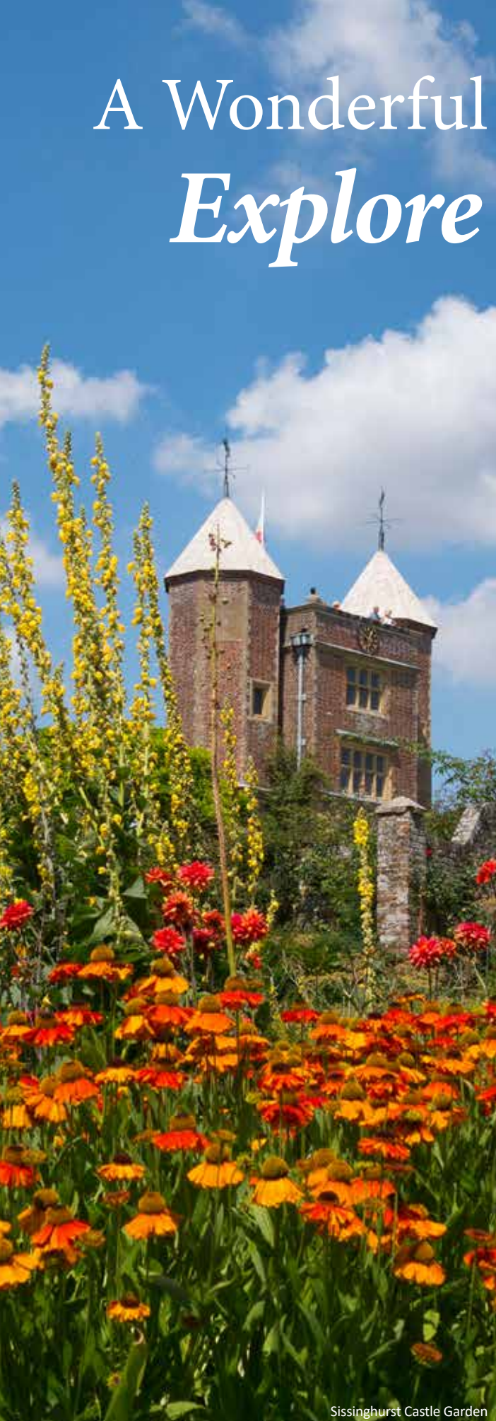
Sissinghurst Castle Garden