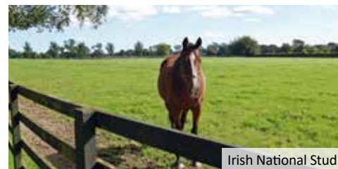
Irish National Stud

This morning, we visit Glin Castle. Nestled on the banks of the River Shannon, the castle is surrounded by beautiful scenery and dates back over 700 years. We enjoy a guided tour of the landscaped gardens and find out more about rare plant species, the castle's storied past and its architectural significance. We enjoy lunch here before heading to Bunratty Castle this afternoon.