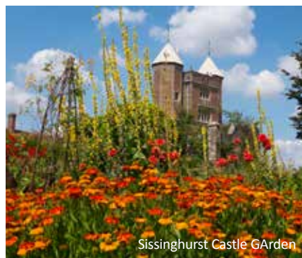
Sissinghurst Castle Garden