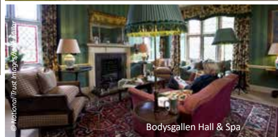
Bodysgallen Hall & Spa