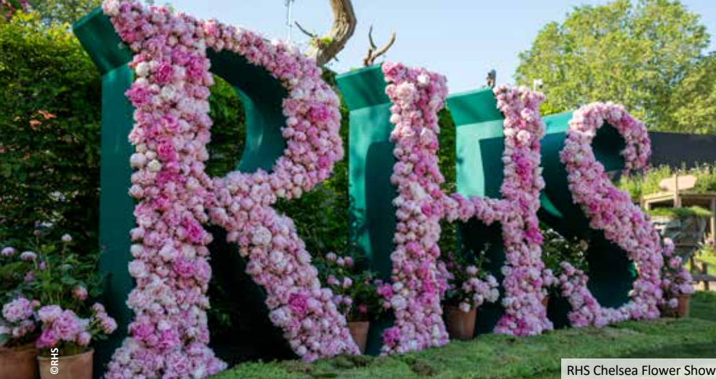
RHS Chelsea Flower Show