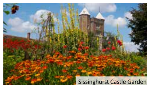
Sissinghurst Castle Garden