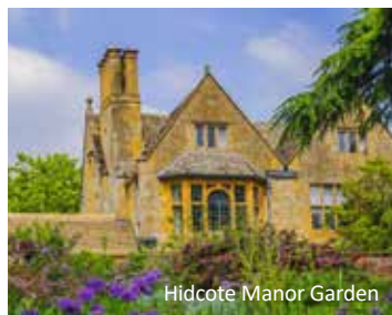
Hidcote Manor Garden