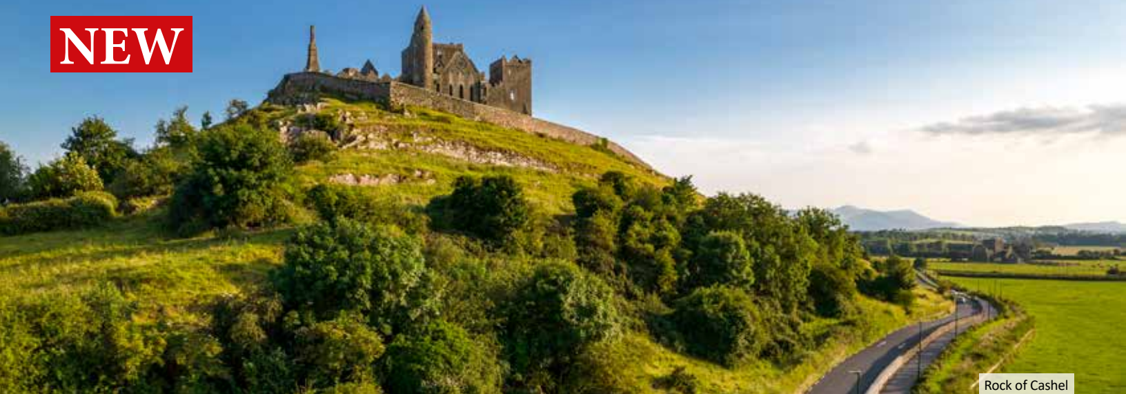
Rock of Cashel