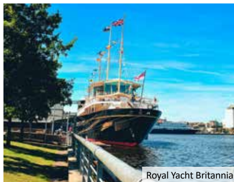
Royal Yacht Britannia