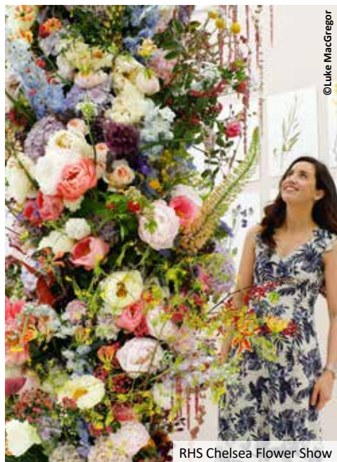
RHS Chelsea Flower Show

This morning we head to Sissinghurst Castle Garden, created in the 1930s by novelist Vita Sackville-West and her husband Harold Nicolson. Set around the ruins of an Elizabethan manor house, these world-famous gardens are laid out as a series of individually-planted 'rooms', including a fragrant Herb Garden and Rose Garden, and are a delight to explore.