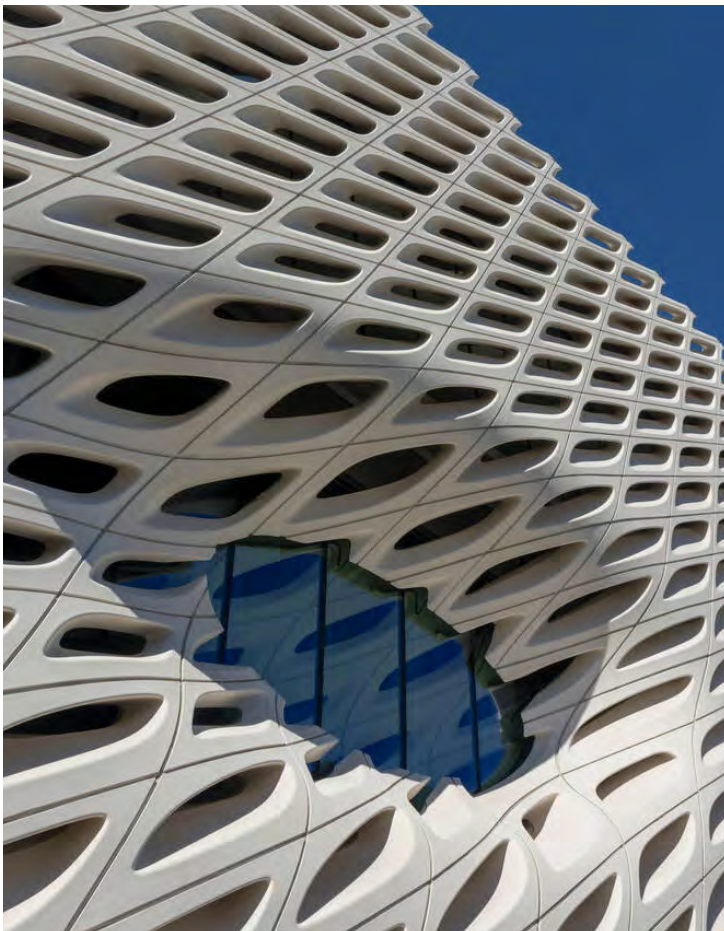
The Broad, Los Angeles

We will sit down for lunch in the outdoor Garden Café at Pasadena's Norton Simon Museum , surrounded by a sculpture garden and Monet-inspired lily ponds. Afterwards, we will participate in a private tour of the museum's superlative collection of Impressionist and Post-Impressionist masterpieces, featuring works by Monet, Degas, Renoir, Van Gogh, Cézanne, and Gauguin.