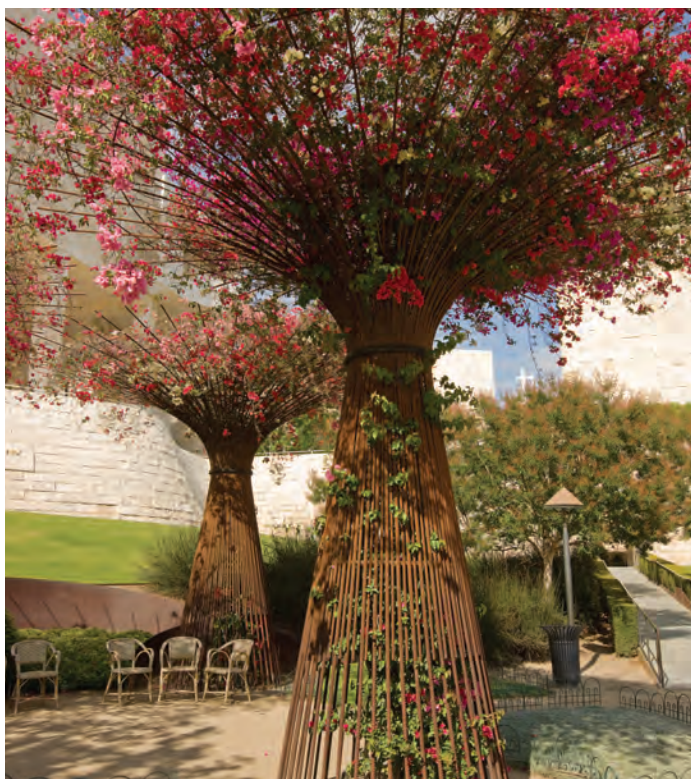
J. Paul Getty Museum, Los Angeles