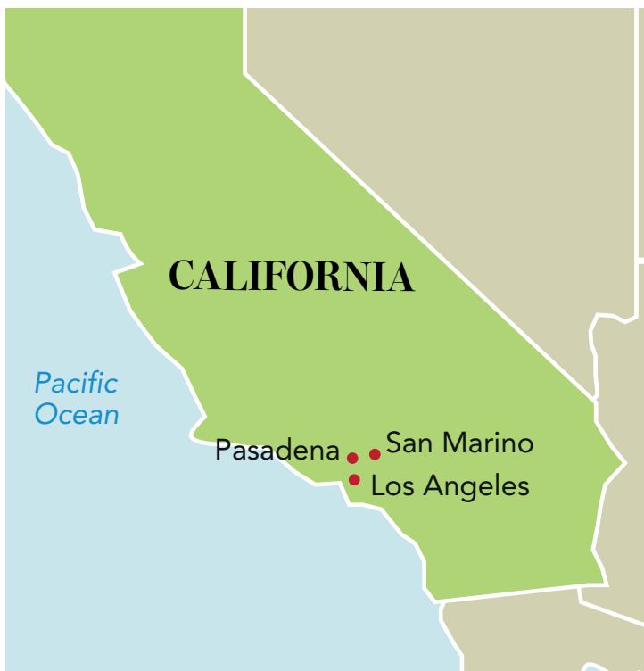
Map of the region

The day is dedicated to two monumental expressions of private patronage. We begin our exploration at the J. Paul Getty Museum , where a private walking tour will illuminate how Richard Meier's architecture of travertine and light enters into a dialogue with the landscape and the masterworks within. Our tour continues through the painting collection, a survey of European art from the Italian Renaissance to the 17th-century Dutch Golden Age.