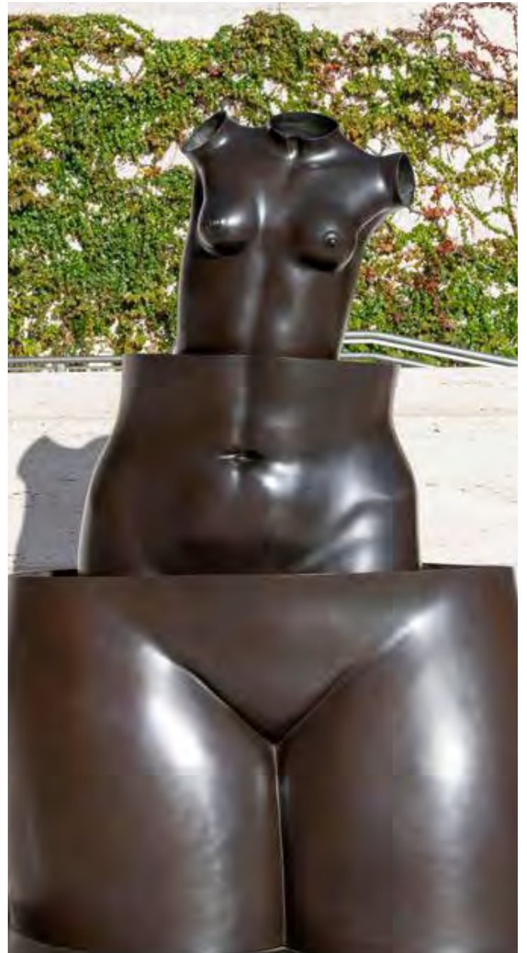
Photos clockwise from top: The Huntington, Pasadena; Rene Magritte, La Folie Des Grandeurs ( Delusions of Grandeur ), 1967, The J. Paul Getty Museum, Los Angeles; Gamble House, Pasadena; Palm trees and the Hollywood Hills