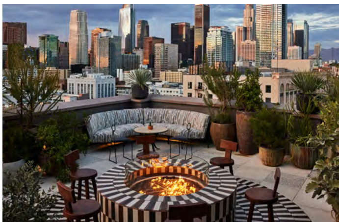
Downtown L.A. Proper Hotel