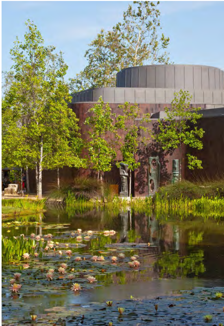
Norton Simon Museum, Pasadena

© 2025 Arrangements Abroad Inc. All Rights Reserved.