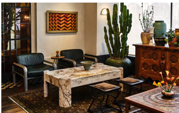
Downtown L.A. Proper Hotel Lobby (top) and Lounge (above)