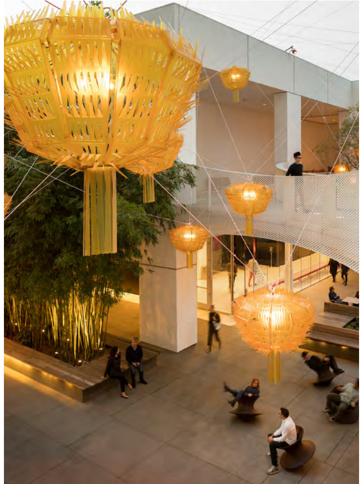
The Hammer Museum, L.A.

A private viewing of selections from the Getty's drawings collection , an area not accessible to the public, offers a look into the working methods of artists from Da Vinci and Rubens to Degas.