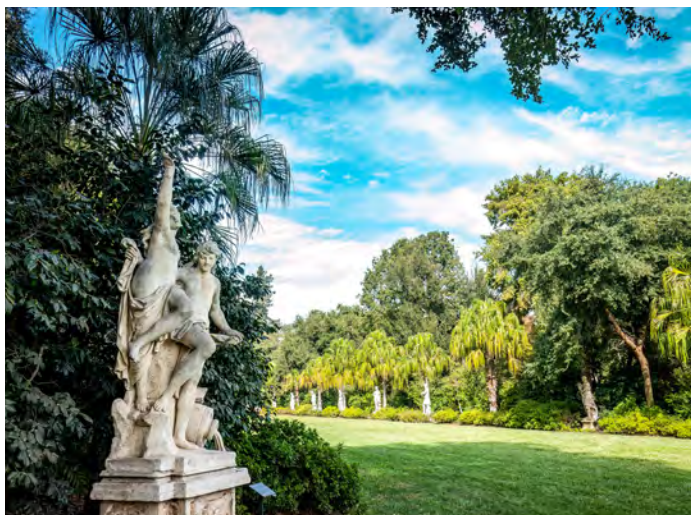
The Huntington, Pasadena

To secure your place, please call National Trust Tours at 888-484-8785.