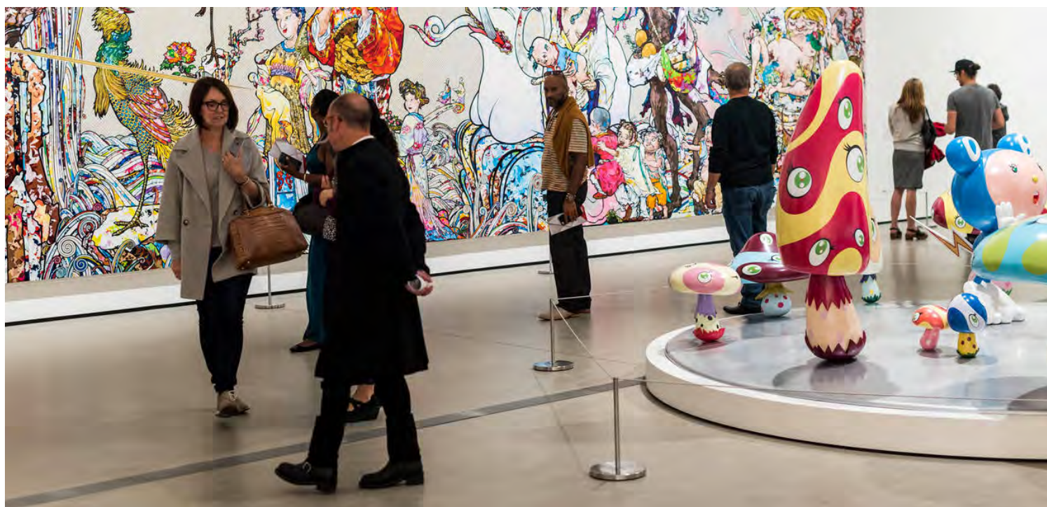
The Broad, Los Angeles

Savor lunch at LULU , a seasonal restaurant created by Alice Waters at the Hammer Museum, and watch the sun set over the Pacific from a Santa Monica rooftop while enjoying a cocktail and dinner.