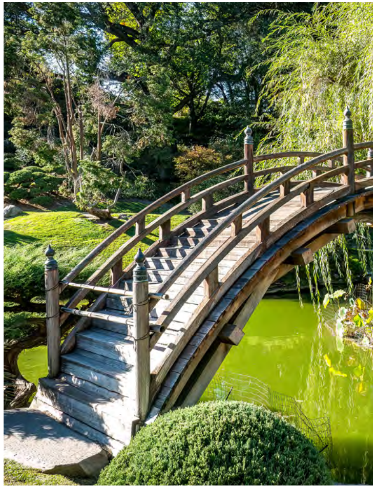
Japanese Garden, The Huntington, Pasadena

This evening, enjoy special access to an artist's studio ( pending confirmation ) followed by dinner at a local favorite. B,D