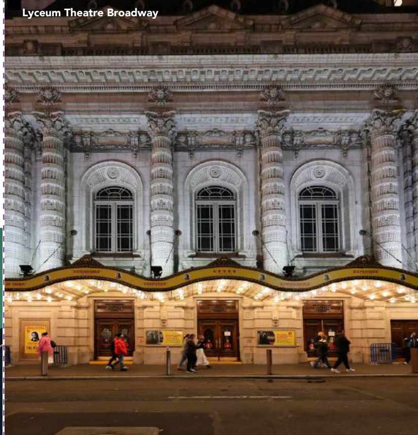
Lyceum Theatre Broadway

INSURANCE: National Trust Tours strongly suggests the purchase of travel insurance. For more information on policy options, visit https://my.travelinsure.com/nationaltrust/plan/ or call 1-800-937-1387.