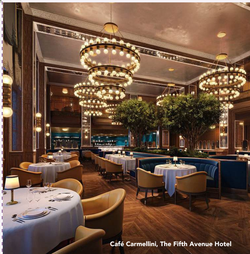
Café Carmellini, The Fifth Avenue Hotel