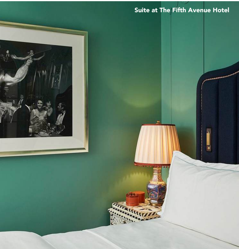
Suite at The Fifth Avenue Hotel