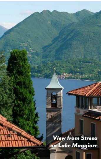
View from Stresa on Lake Maggiore

baroque palace with its astounding collection of art and antiques, and the summerhouse, which is home to a mosaic marine-themed grotto. Stroll the lush gardens, filled with rare flowers and plants, statuary, architectural details and strutting white peacocks. Reboard the boat for the return to Stresa, the setting for Hemingway’s iconic novel “A Farewell to Arms.” Enjoy spectacular mountain views as you explore the town and have lunch on your own. This afternoon at the hotel, hear a lecture by a local expert on the silk industry, then enjoy dinner on your own.