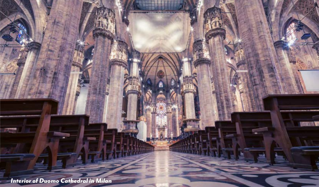
Interior of Duomo Cathedral in Milan

butterscotch. Enjoy time to explore Bellagio at your own pace and browse through its lovely boutiques. Enjoy lunch on your own at a local eatery before heading back to Como. Later, immerse yourself in the local culture and traditions in a conversation with residents, and savor the delights of a provided Northern Italian dinner in a local ristorante.