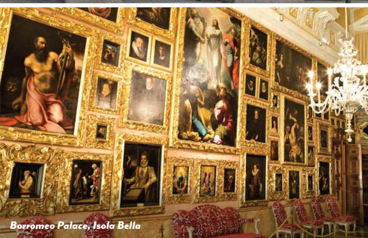
Borromeo Palace, Isola Bella