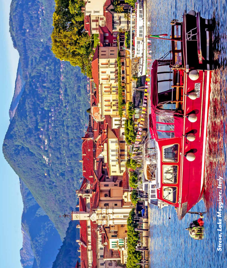
Siresa, Lake Maggiore, Italy

PRSRT STD U.S. Postage PAID Gohagan & Company