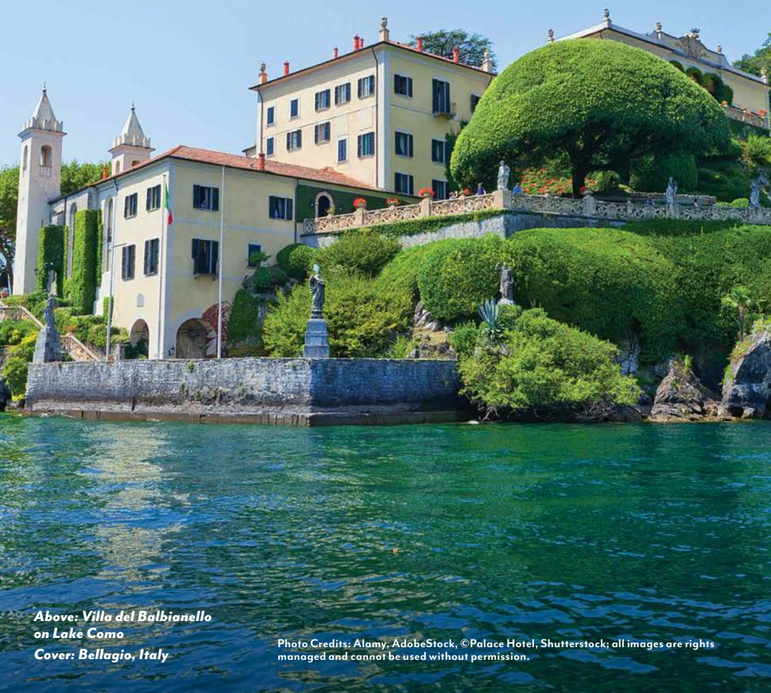
Above: Villa del Balbianello on Lake Como