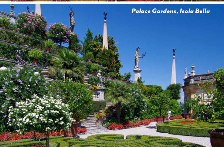
Palace Gardens, Isola Bella