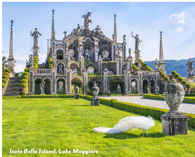
Isola Bella Island, Lake Maggiore