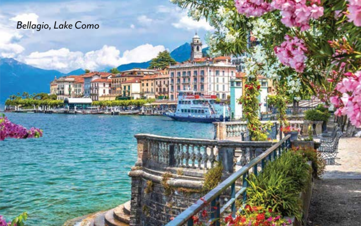
Bellagio, Lake Como