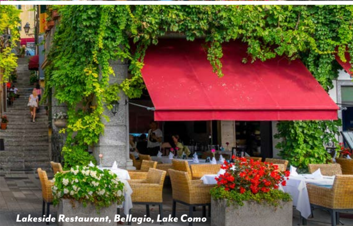
Lakeside Restaurant, Bellagio, Lake Como