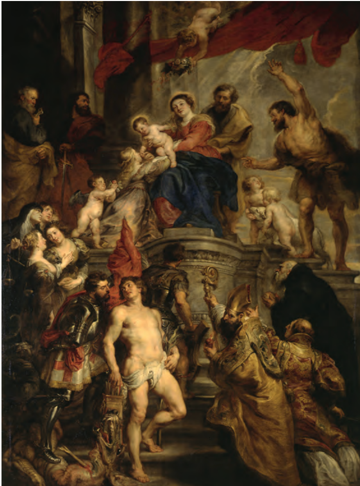
Peter Paul Rubens, Enthroned Madonna Adored by Saints (detail), Collection KMSKA, Antwerp

This evening promises an unforgettable event fit for royalty: You will be hosted for dinner and a concert at a medieval castle not usually open to the public .