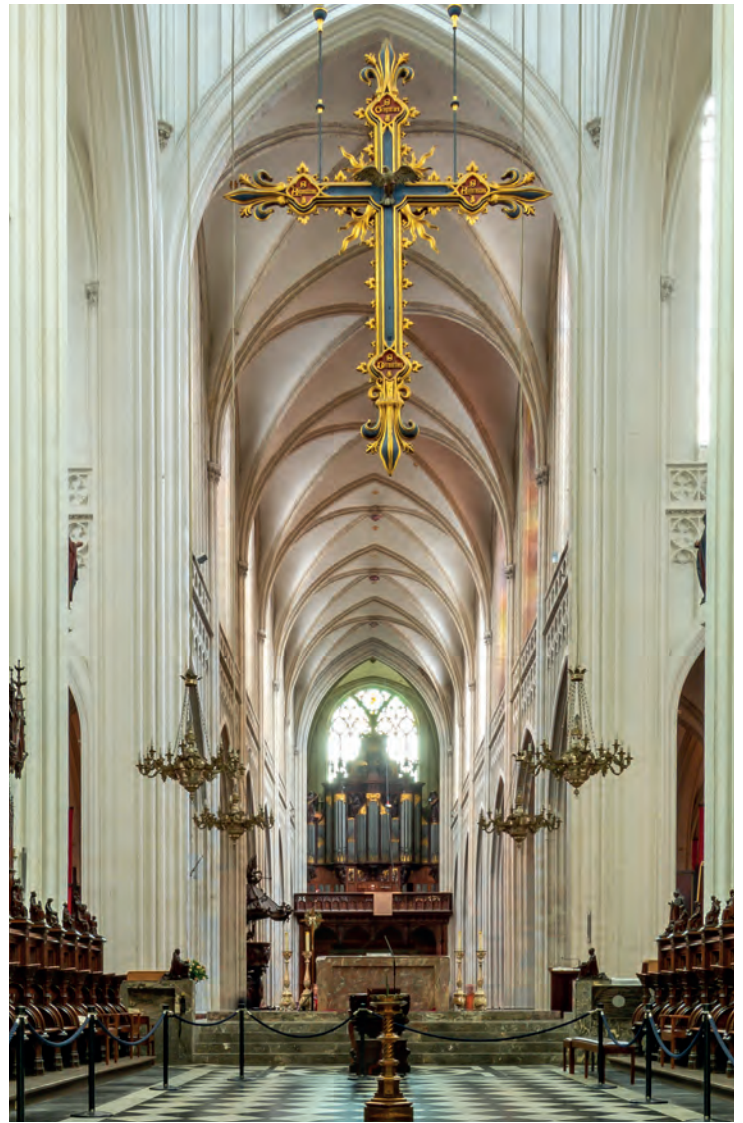
Cathedral of Our Lady, Antwerp