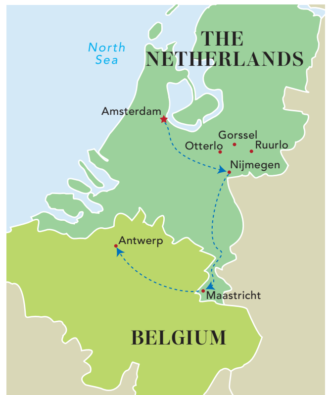
Map of the region

Visit Arrangements Abroad's website for more information about Activity and Pace Levels at www.arrangementsabroad.com/faqs .