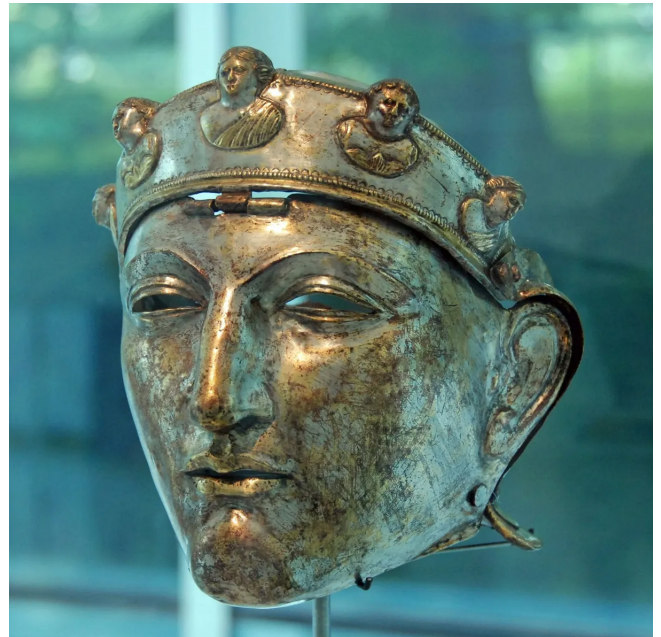
Roman bronze helmet, Museum Valkhof, Nijmegen

From Amsterdam to Antwerp , this river voyage goes beyond the standard cultural journey, profoundly rewarding the dedicated art lover before and after our special access in Maastricht. To reserve your place , contact National Trust Tours at 888.484.8785 or info@nationaltrusttours.com