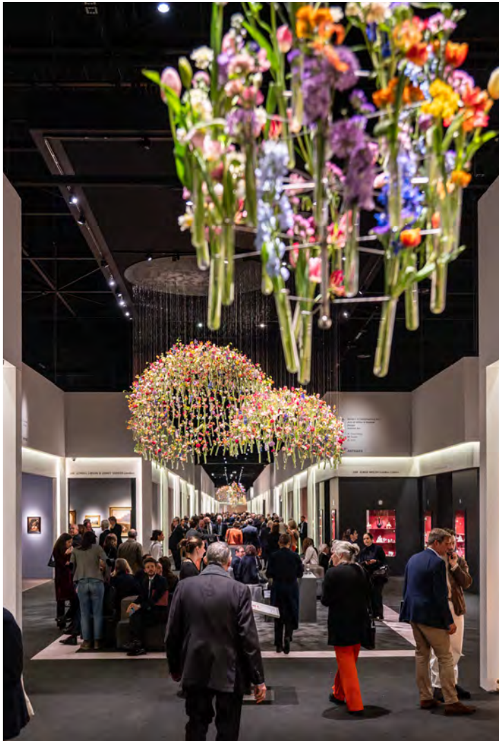
TEFAF Maastricht

What truly sets TEFAF apart is its unrivaled, rigorous vetting process. Before the doors open, a committee of independent international experts meticulously scrutinizes every single item for quality, authenticity, and condition.