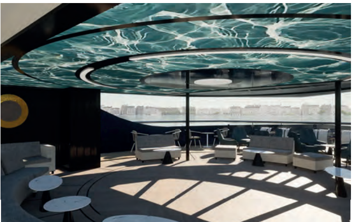
Transcend (top); Aft Lounge and Main Lounge (above) (renderings)