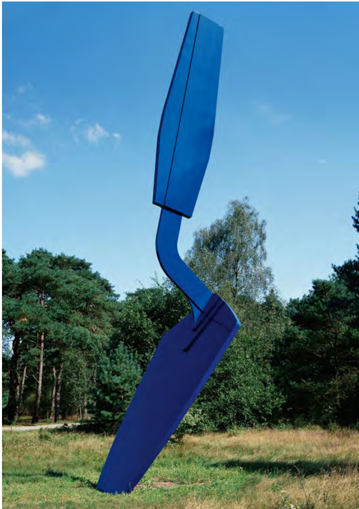
Claes Oldenburg, Trowel 1971, Kröller-Müller Museum, Otterlo

Option 3: Transfer to Museum MORE , Holland's largest museum for modern realism. Experience its collections over two distinct, exciting spaces: View its main location in Gorsse 's former town hall, which was expanded with a modern, light-filled extension to create spacious galleries.