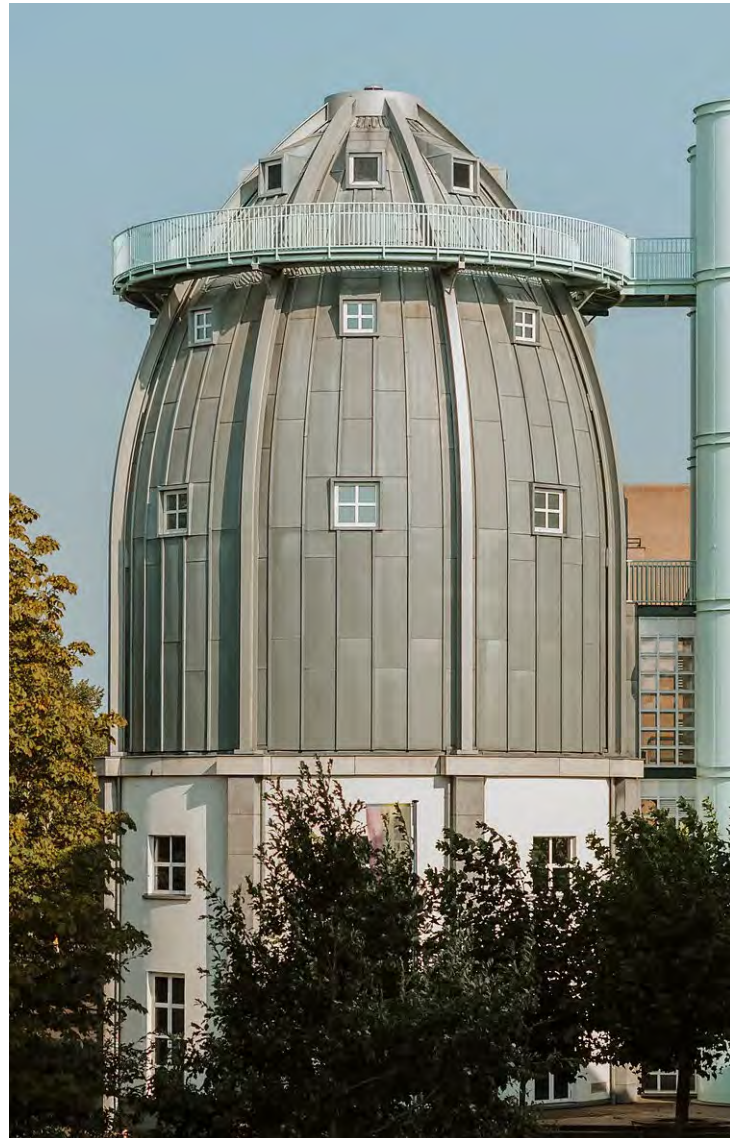
Bonnefanten Museum, Maastricht

With your VIP Early Access , you will enter this extraordinary fair before the general public, allowing you to explore these vetted, museum-quality masterpieces at your leisure. Transportation will be provided for you to return to the ship for lunch, with hourly shuttles available throughout the day. Return to Transcend this evening for dinner.