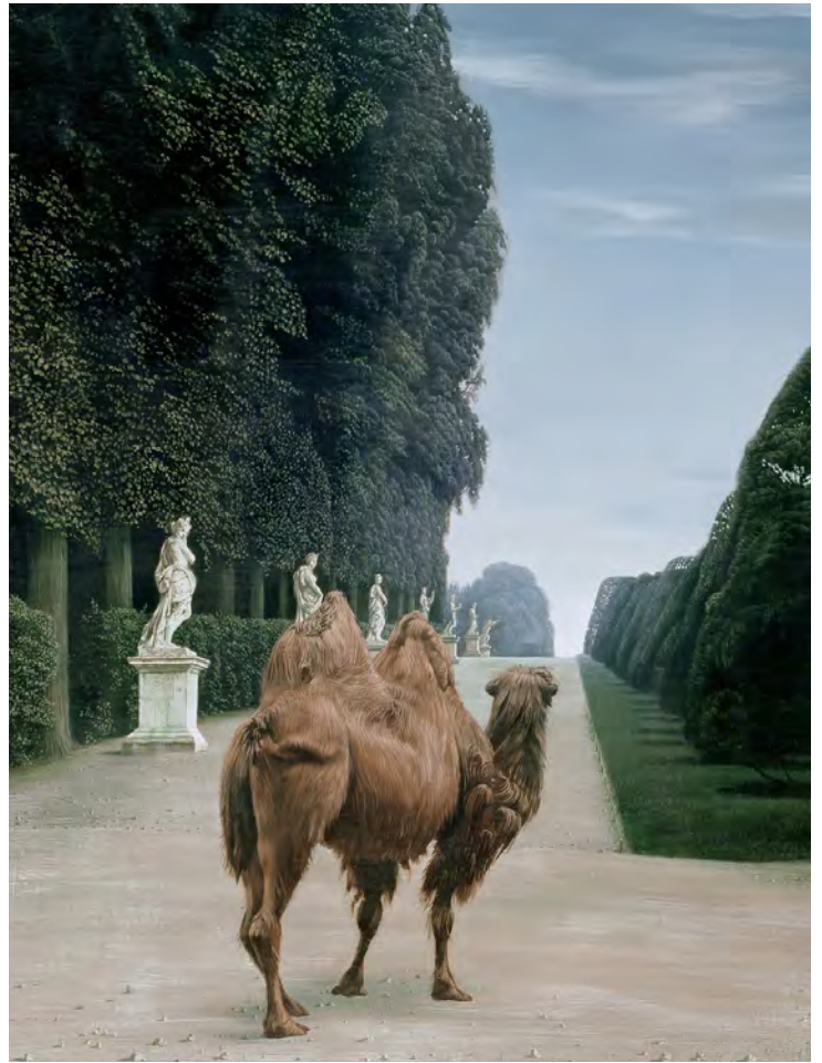
Carel Willink, Camel in the Park of Versailles (detail), 1956, Ruurlo Castle, photo © Sylvia Willink-Pictoright

Next, visit the museum's satellite building, housed in the 14th-century moated Ruurlo Castle . It is primarily dedicated to the museum's extensive collection of works by Carel Willink, one of the leading Dutch neorealist painters.