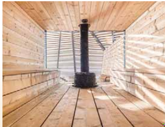
Löyly Sauna, Helsinki

Arktikum. This engaging science center and history museum in Rovaniemi reveals unique aspects of life in the Arctic. On a guided tour, view fascinating exhibits about the culture, history, wildlife and natural environment of northern Lapland.