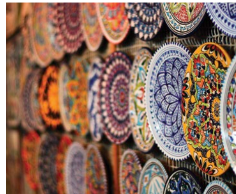
Handcrafted Moroccan ceramics