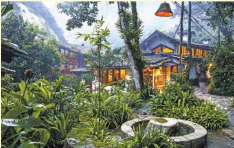
Inkaterra Machu Picchu Pueblo | Machu Picchu