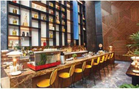
Pullman Lima Miraflores | Lima