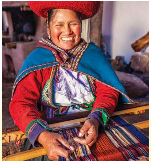
Traditional Peruvian weaving