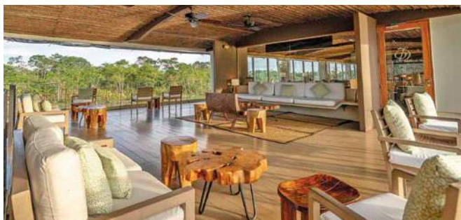
Delfin III covered deck

Please note: Program-specific terms and conditions are available at https://natrus.ahitravel.com/destinations/2000A?schoolid=250 .