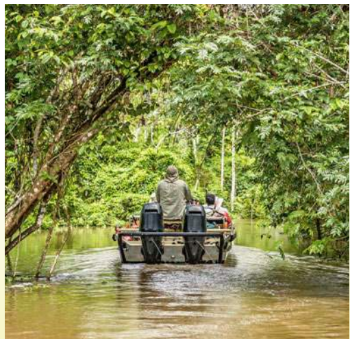
Exploring the Amazon aboard a skiff boat