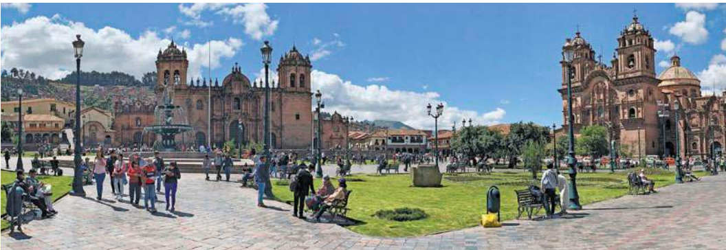
Plaza de Armas, Cusco

Set out aboard skiff boats, anticipating the day's astounding and unexpected wildlife encounters. Pacaya Samiria National Reserve, where the ship cruises, is one of Peru's largest wildlife preserves with more than five million acres of rich biodiversity. Marvel at gray and pink dolphins and watch for toucans and macaws hiding in the rain forest.