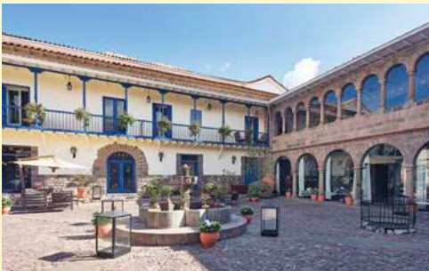
Palacio del Inka | Cusco