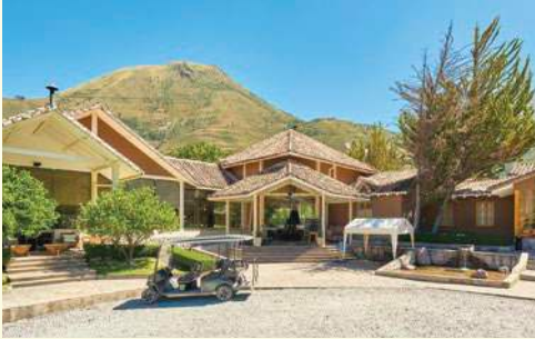
Casa Andina Premium Valle Sagrado | Sacred Valley