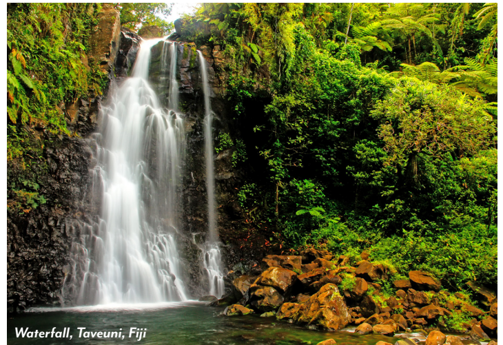
Waterfall, Taveuni, Fiji