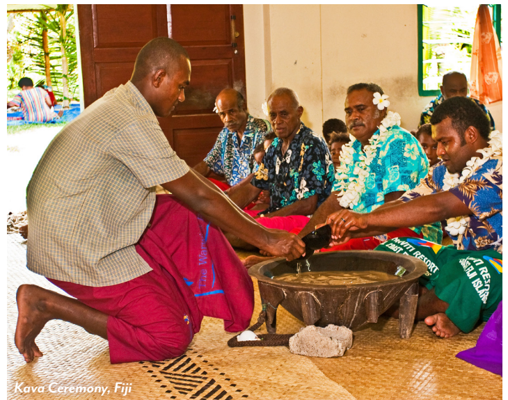
Kava Ceremony, Fiji

All Program Features are contingent upon final brochure pricing. 2027