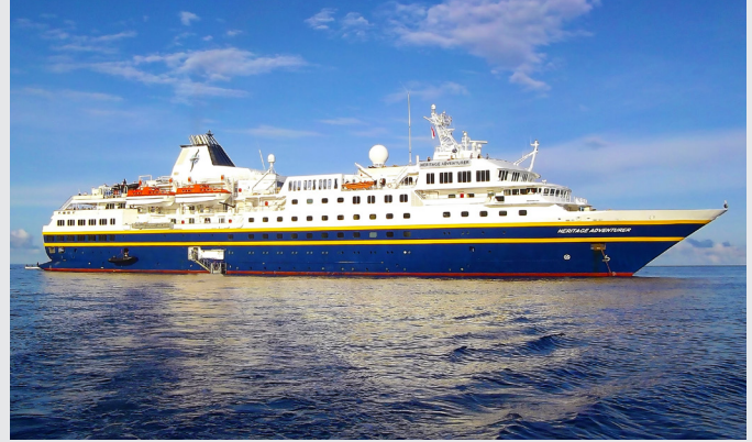
Heritage Adventurer Exclusively Chartered Small Ship