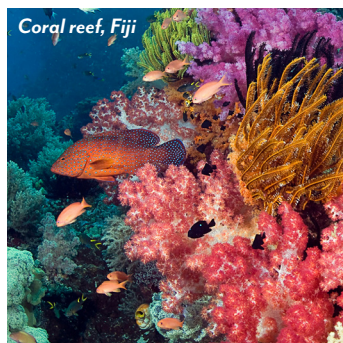
Coral reef, Fiji